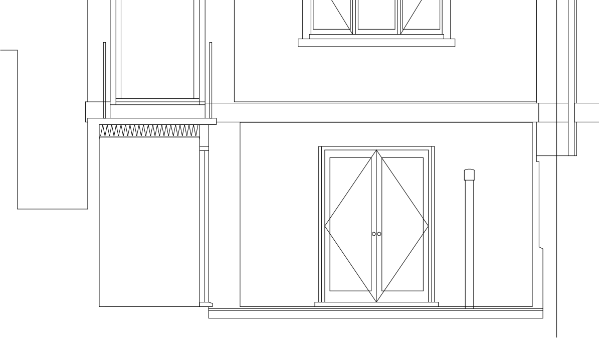
Ext Basement Section-AA