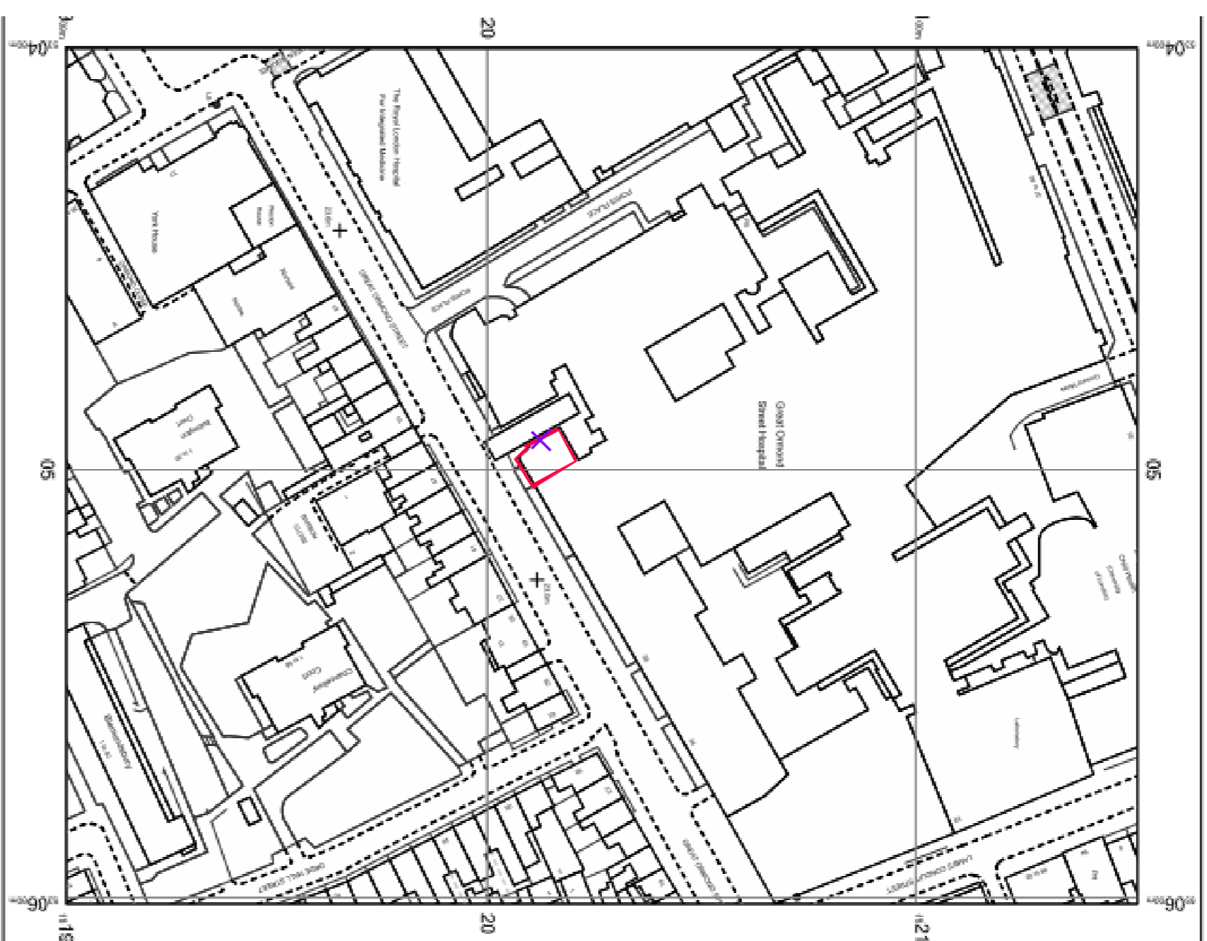
Location Plan Scale: 1:1250