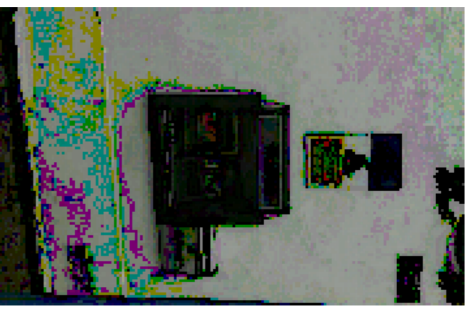
Existing 5884 '5' Key height 930mm