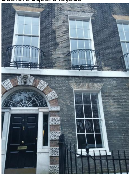
Bedford Square façade detail