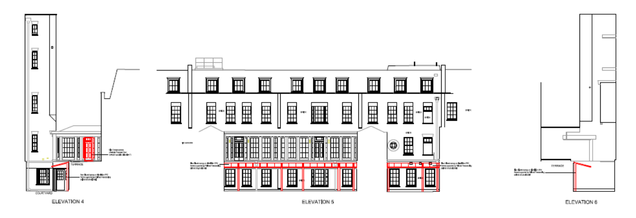
Internal Courtyard elevations – modifications shown in red