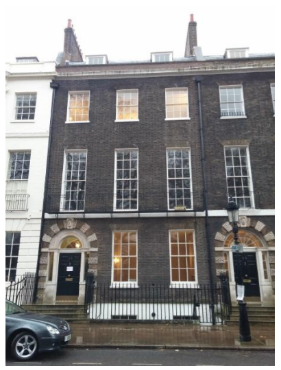
Bedford Square façade detail