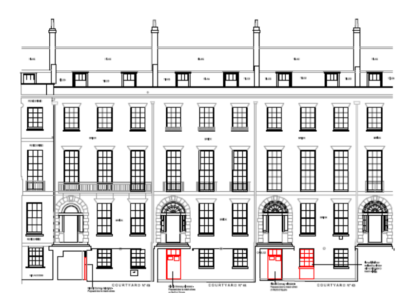
Bedford Square façade – modifications shown in red

There are no proposed modifications to the façade of Bedford Avenue.