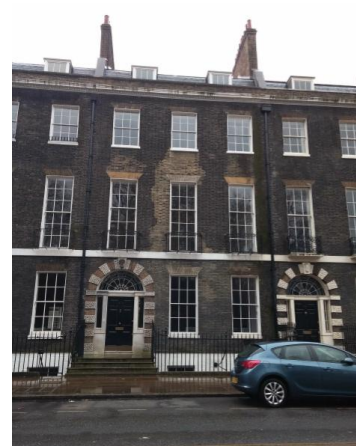
Bedford Square façade