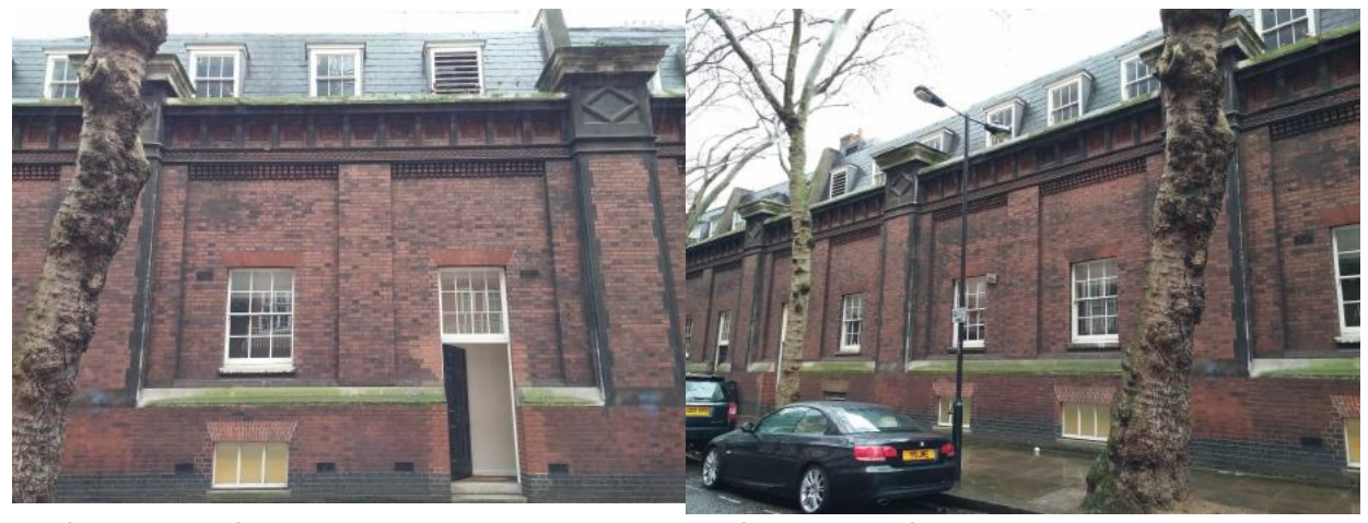
Bedford Avenue façade