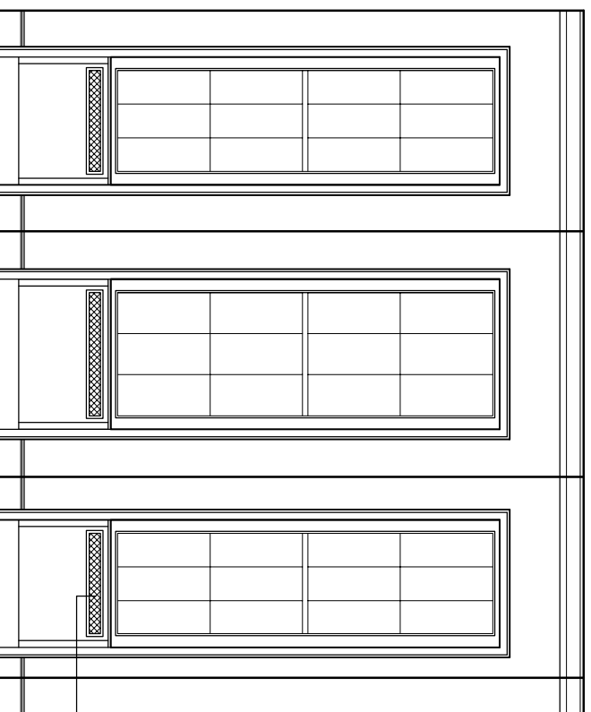
Proposed Radiator Casing Elevation