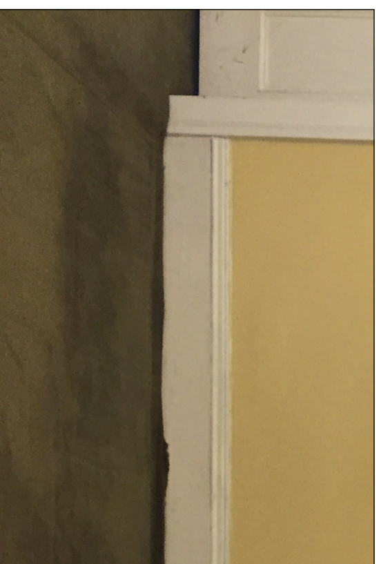
Existing Timber Skirting