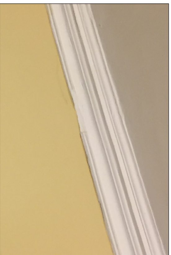
Existing Plaster Corncing