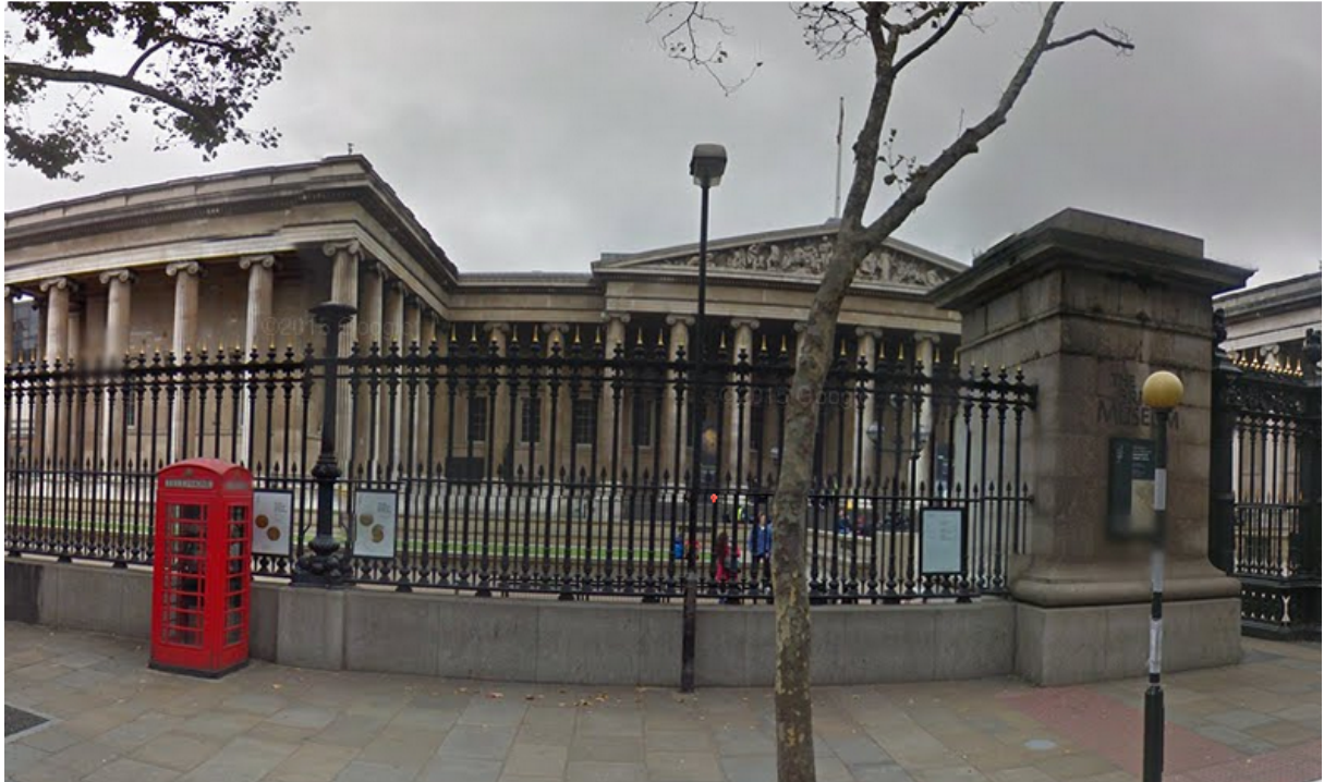
Looking north-west toward the British Museum from Great Russell Street