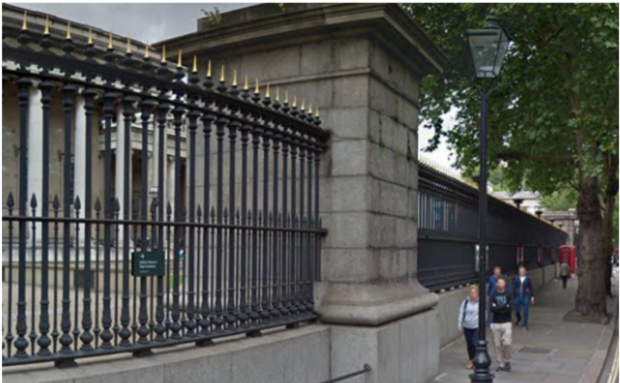
View of the Museum from Great Russell Street including fence line and rectangular pillars