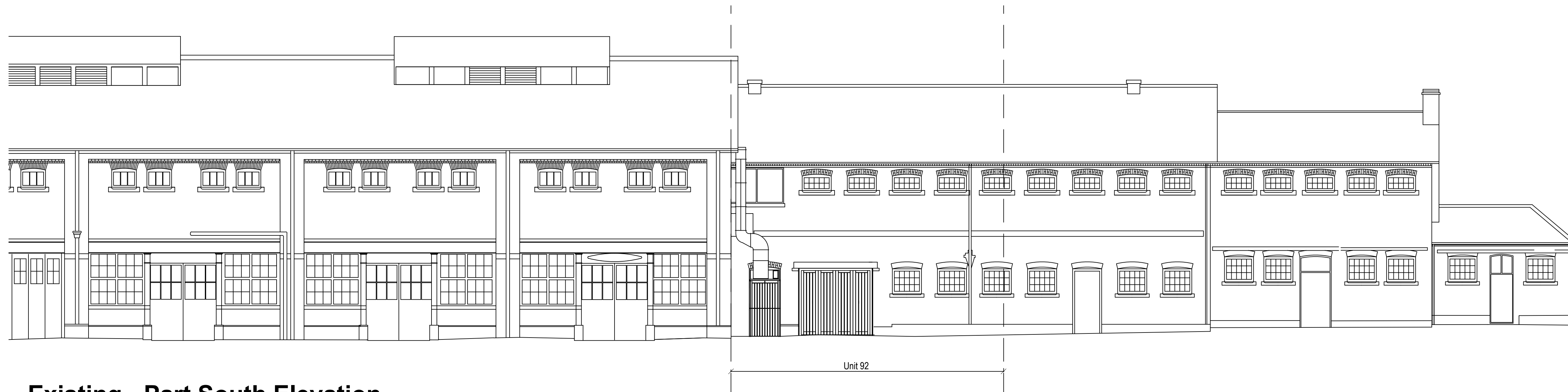
Existing - Part South Elevation Scale 1:100

Please note that information used to produce these drawings is based on measured survey supplied by others; Heritage Architecture can not be held responsible for any inaccuracies that may exist. Please do not scale drawings. All dimensions should be verified on site.