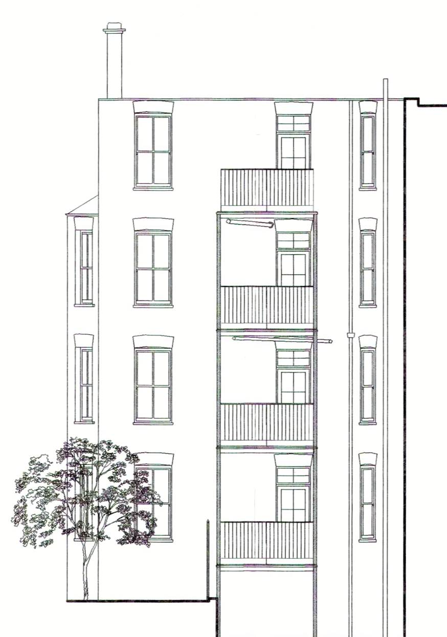
proposed side elevation C-C scale 1:100