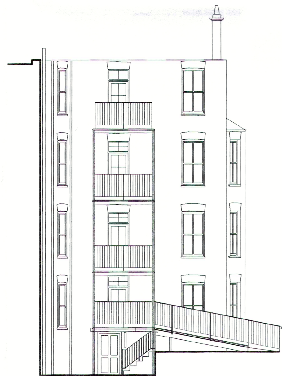
proposed side elevation B-B scale 1:100