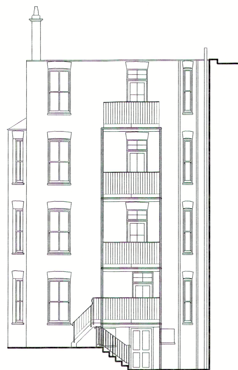
proposed side elevation A-A scale 1:100