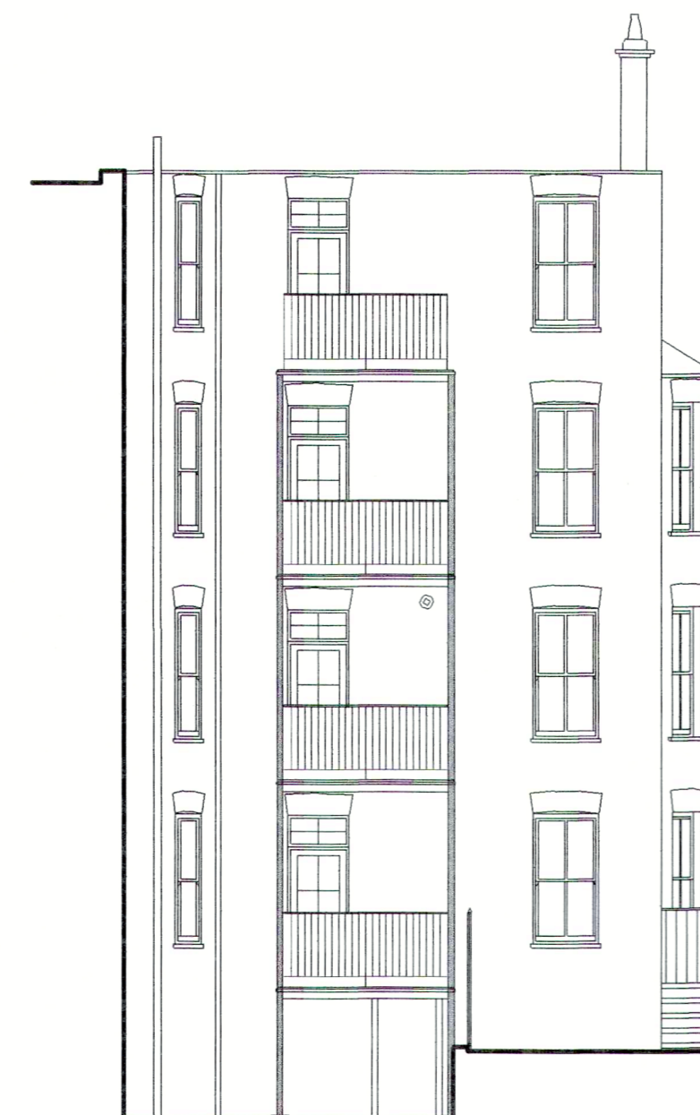
proposed side elevation D-D scale 1:100