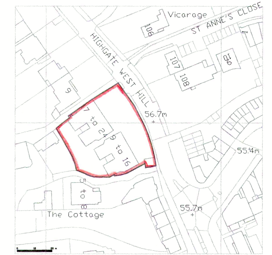
location plan 1:1250