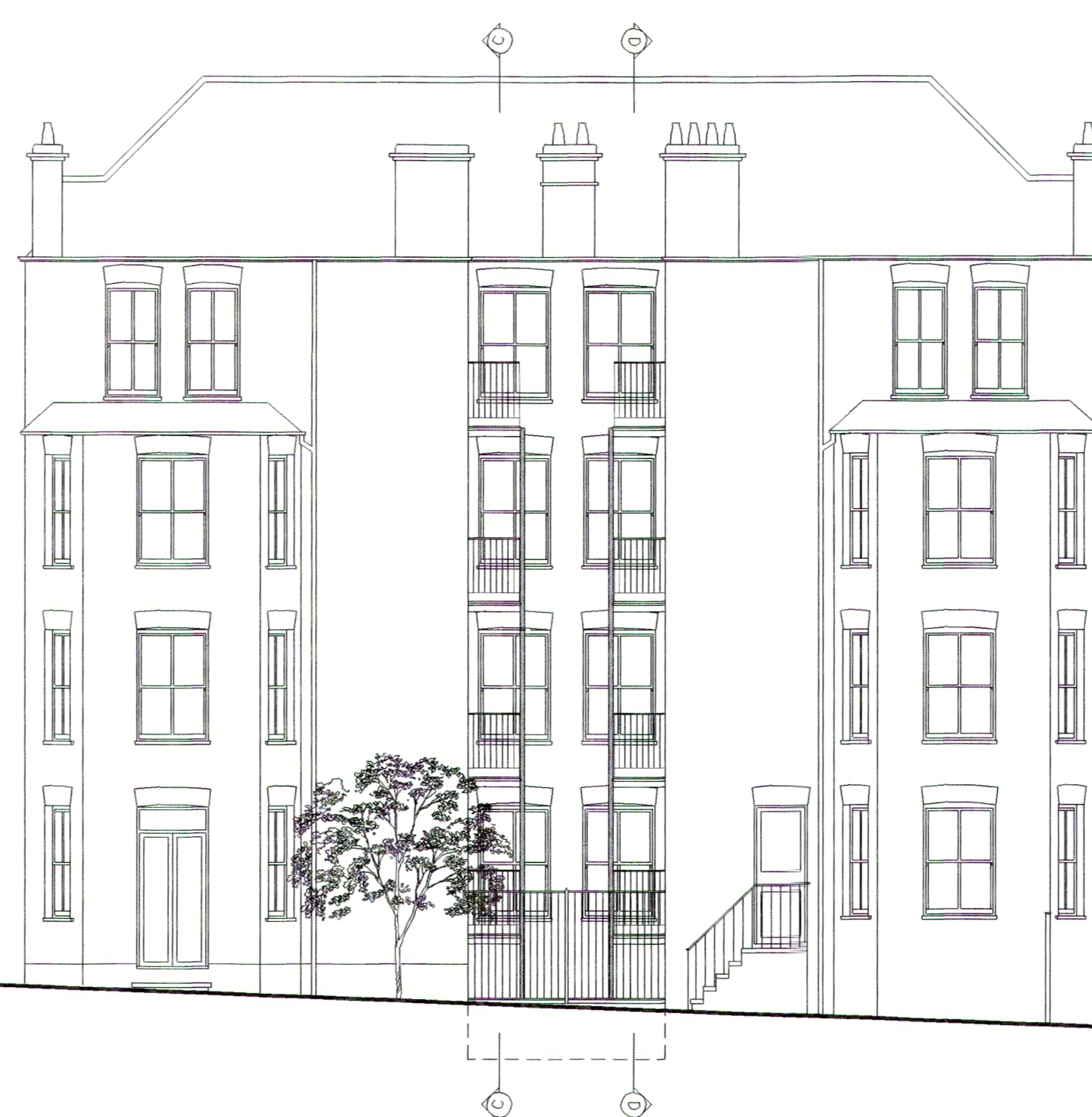
proposed rear elevation flats 9-16 south block. scale 1:100