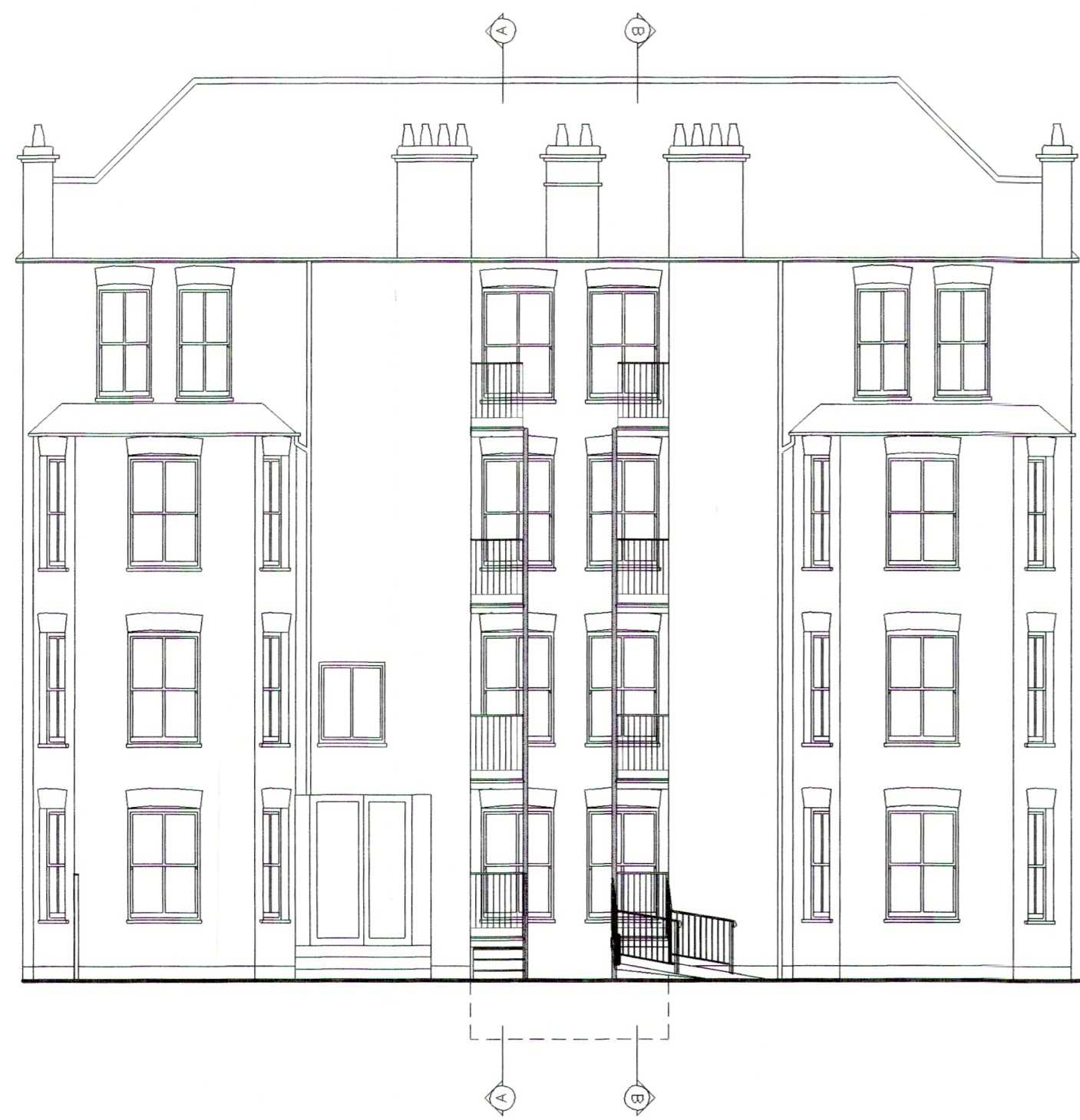
proposed rear elevation flats 17-24 north block. scale 1:100