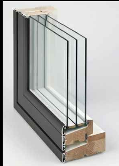
Hughes Parry Tower: Window

VieoZinc standing seam rainscreen cladding with zinc finish