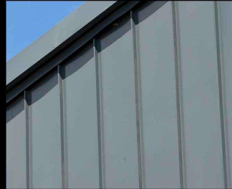
Hughes Parry Tower: Mansard

Wienerberger pagus Red with Tamac Y113 medium buff mortar with a flush joint