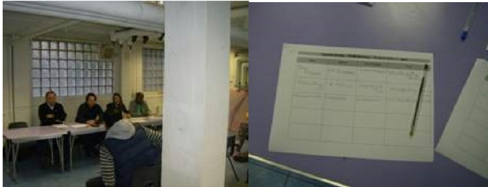
Only 3 sign in

I also attach for your information my reply to the accusations made against me.