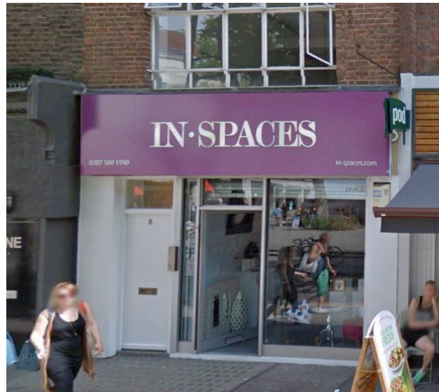
3 TOTTENHAM STREET VIEW

* ALL EXISTING SITE DIMENSIONS TO BE CONFIRMED BY SITE CONTRACTOR