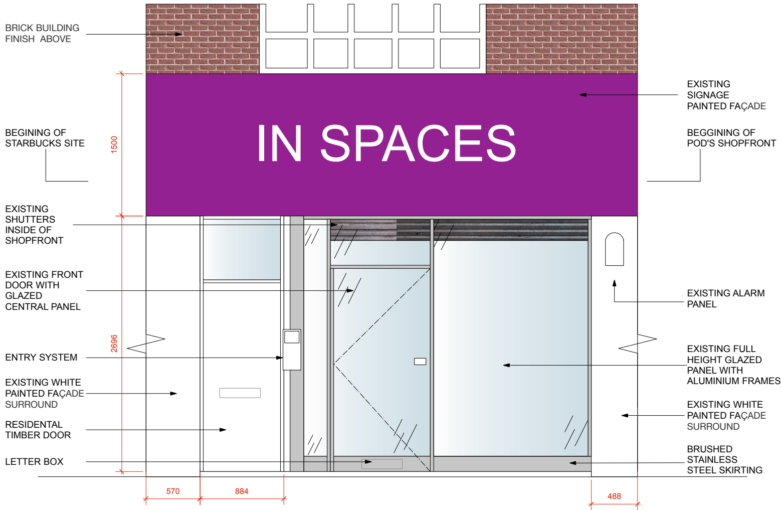
1 EXISTING SHOPFRONT ELEVATION Scale: 1:20