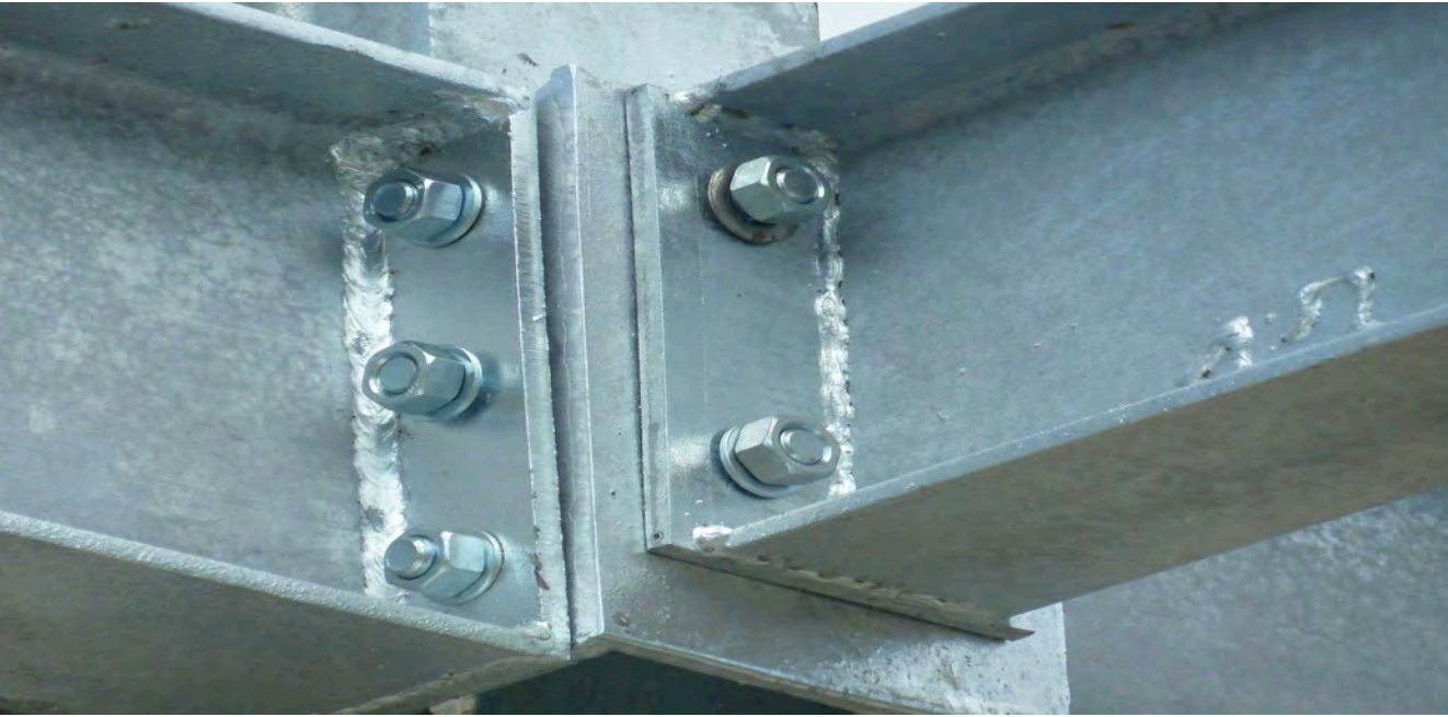
STAIRS STRUCTURE: UNCOATED GALVANISED STEEL PROFILES