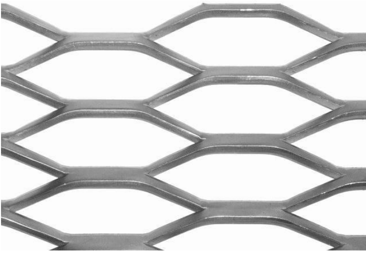
BALUSTRADE: UNCOATED GALVANISED STEEL EXPANDED METAL MESH