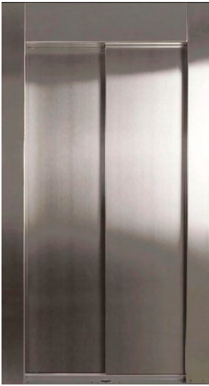
LIFT SHAFT: POWDER COATED GALVANISED STEEL PANELS, COLOUR RAL 7009 (green grey), STAINLESS STEEL DOORS