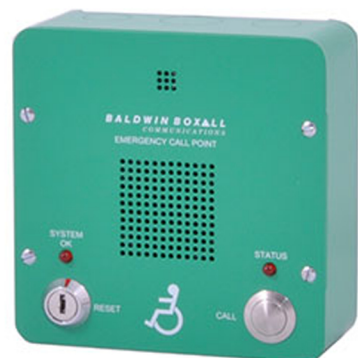
Disabled call point mounted externally to existing wall.

For ramp information refer to sketch 28731-SOAS-SKE-XXX-XX-143