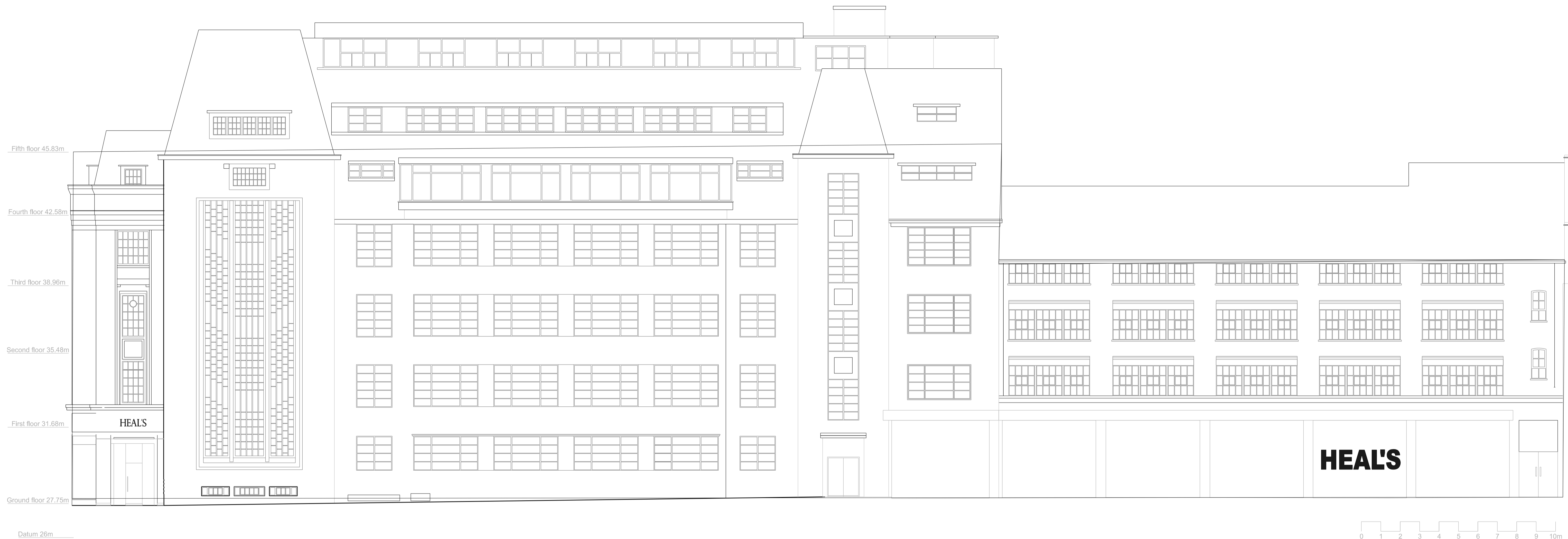
Section A - Alfred Mews Elevation