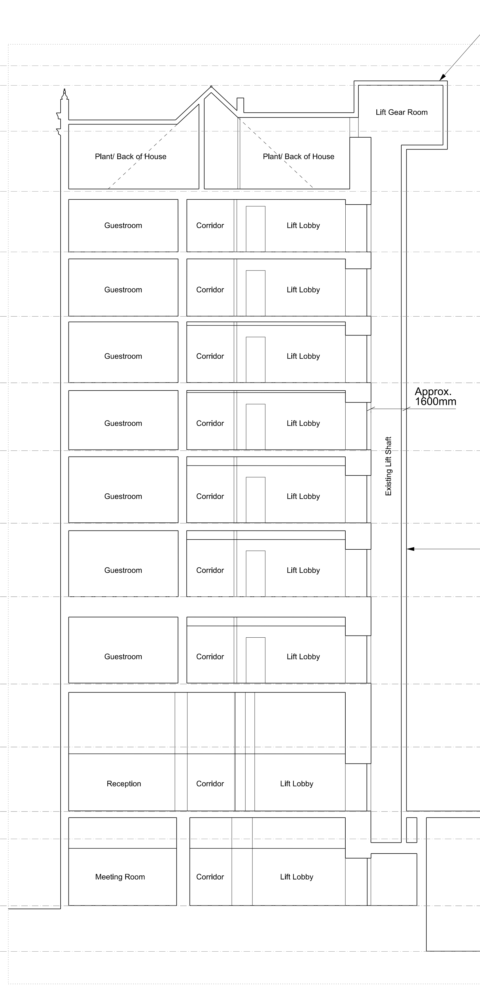
Section Through Existing Lift Shaft (within lightwell)