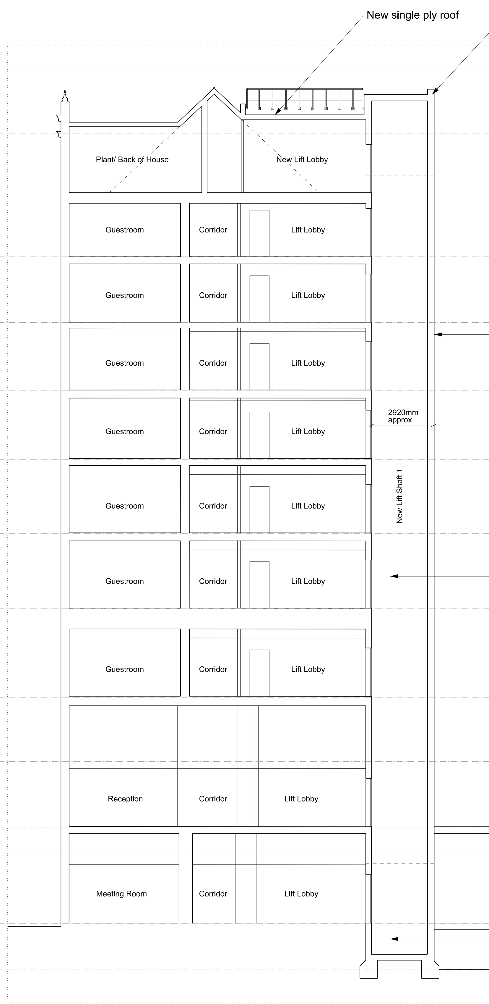
Section Through Proposed Lift Shaft