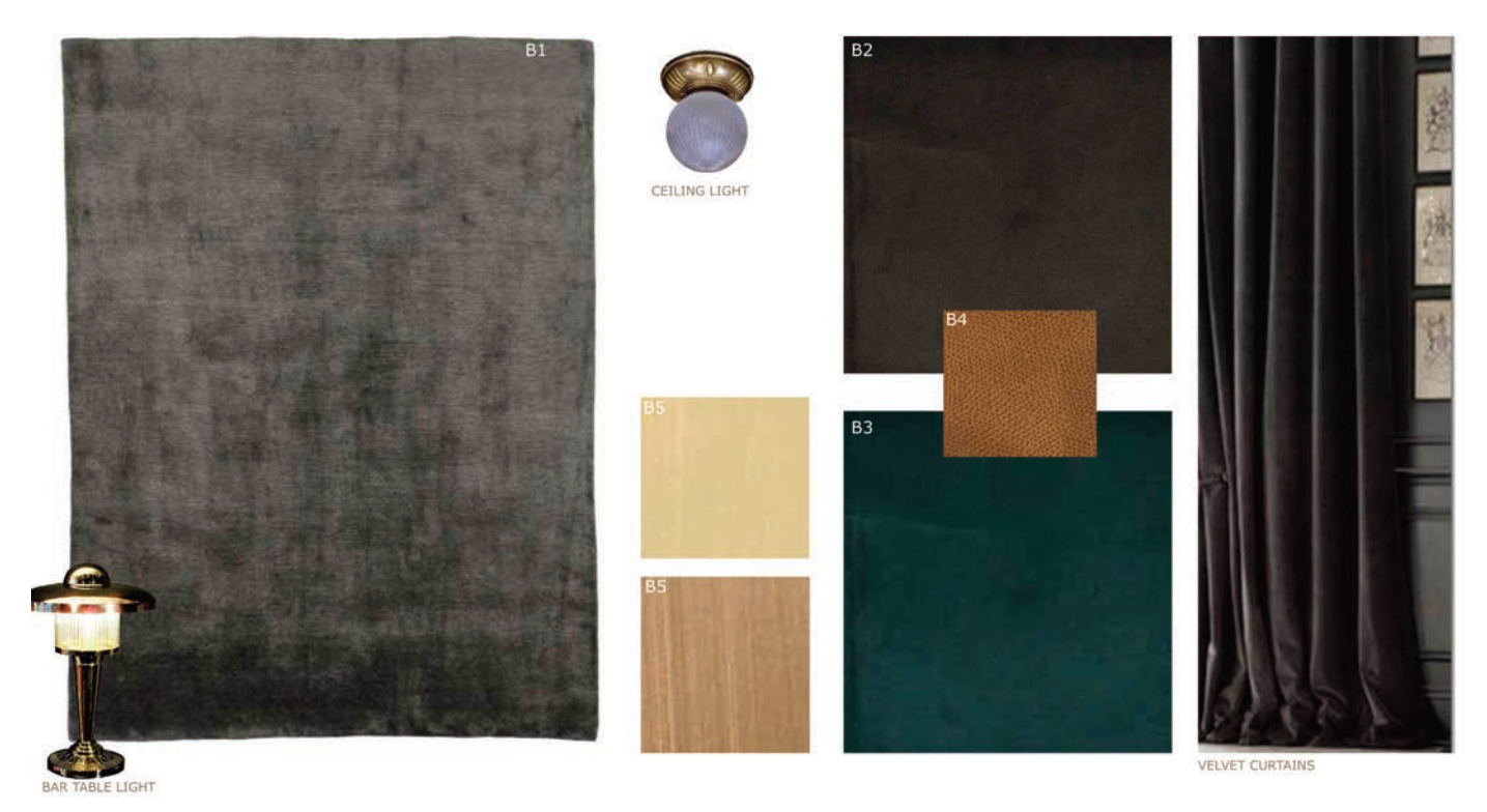
B1. fitted carpet / B2. velvet curtain / B3. velvet upholstery / B4. inset leather tray / B5. ceiling paint

Screening Room Finishes - Tara Bernerd & Partners