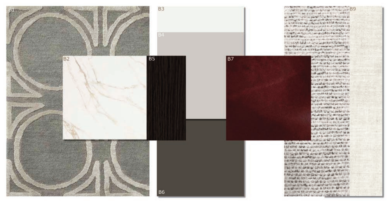
B1. fitted carpet / B2. credenza top / B3. ceiling, door leaf & cornice paint / B4. wall paint / B5. timber table table / B6. panelling paint / B7. chairs / B8. main curtain / B9. sheer curtain

Meeting Room Finishes - Tara Bernerd & Partners