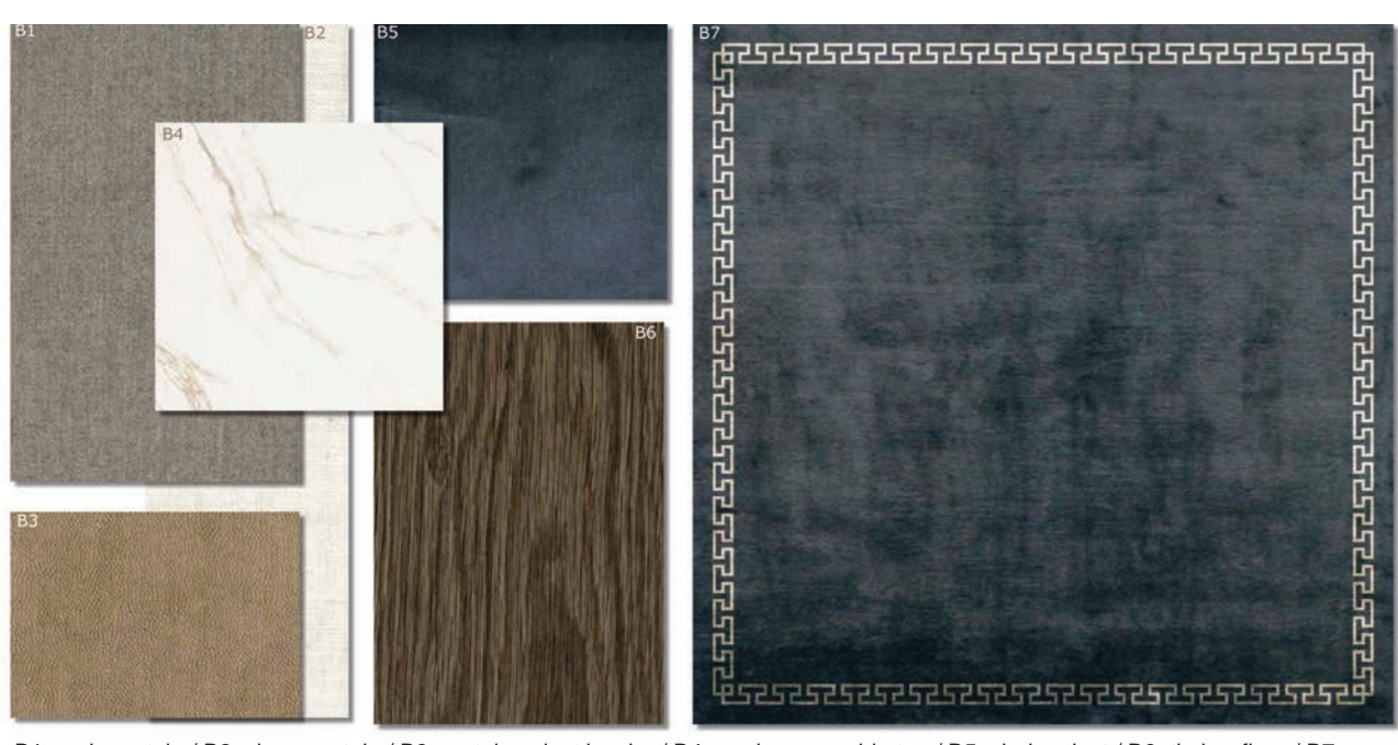
B1. main curtain / B2. sheer curtain / B3. curtain velvet border / B4. credenza marble top / B5. chair velvet / B6. timber floor / B7. rug

Meeting Room Finishes - Tara Bernerd & Partners