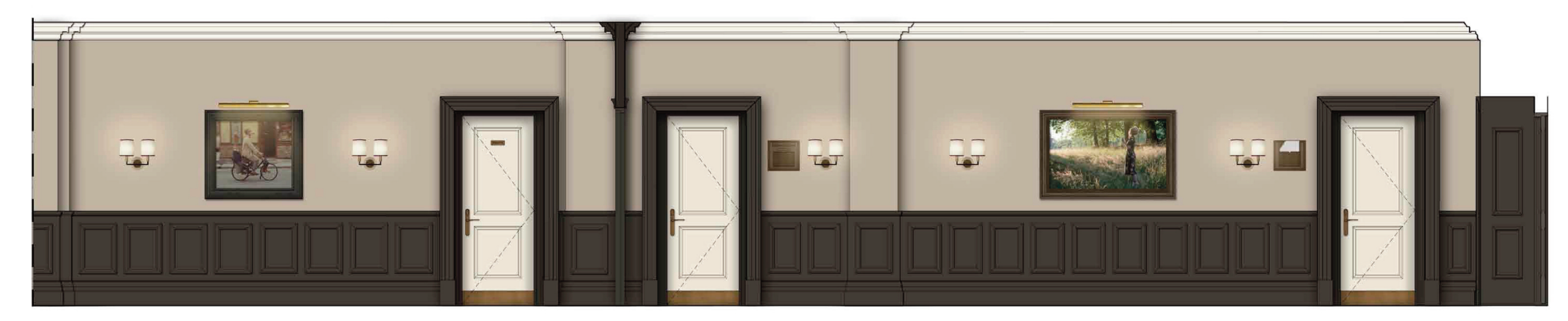
Meeting Room Corridor Elevation - Tara Bernerd & Partners