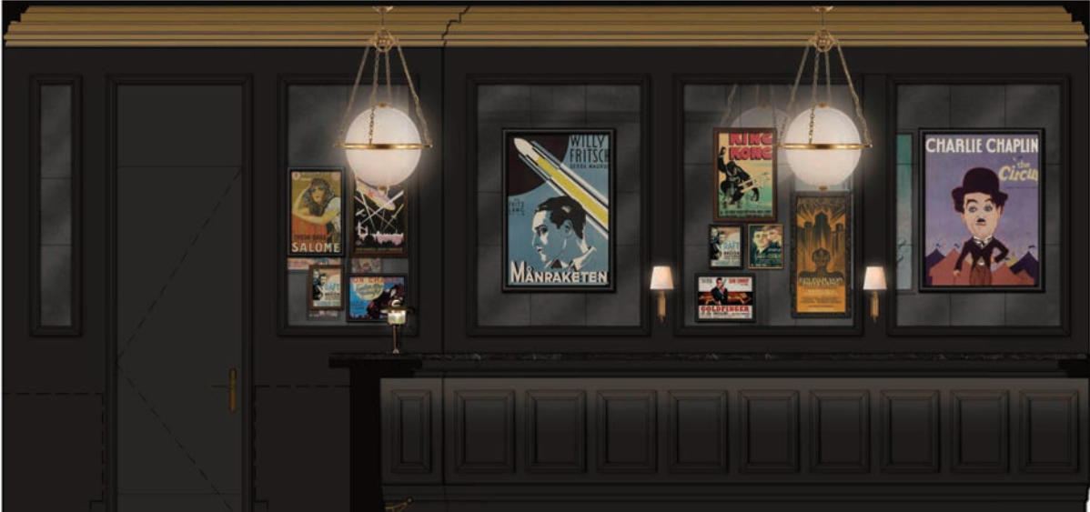
Screening Room Elevations - Tara Bernerd & Partners