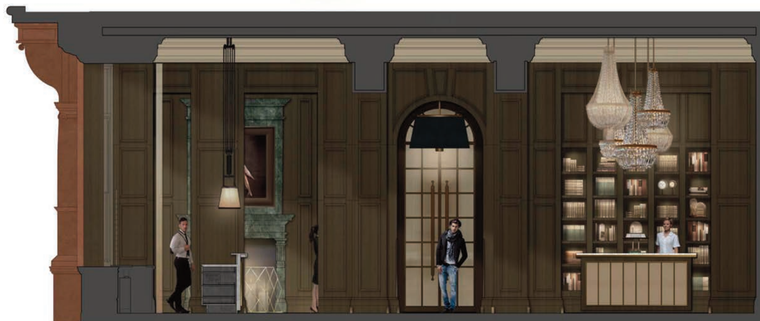
Proposed Reception Elevations - Tara Bernerd & Partners showing new reception and concierge desk, timber panelling with integrated shelving and fireplace in lounge area

The interior design proposal includes a new plasterboard ceiling with mouldings, new mosaic floor to match the lobby, inset rug, half-height shutters to windows, a fire-place with candles and new timber panelling with integrated bookshelves & retail units.