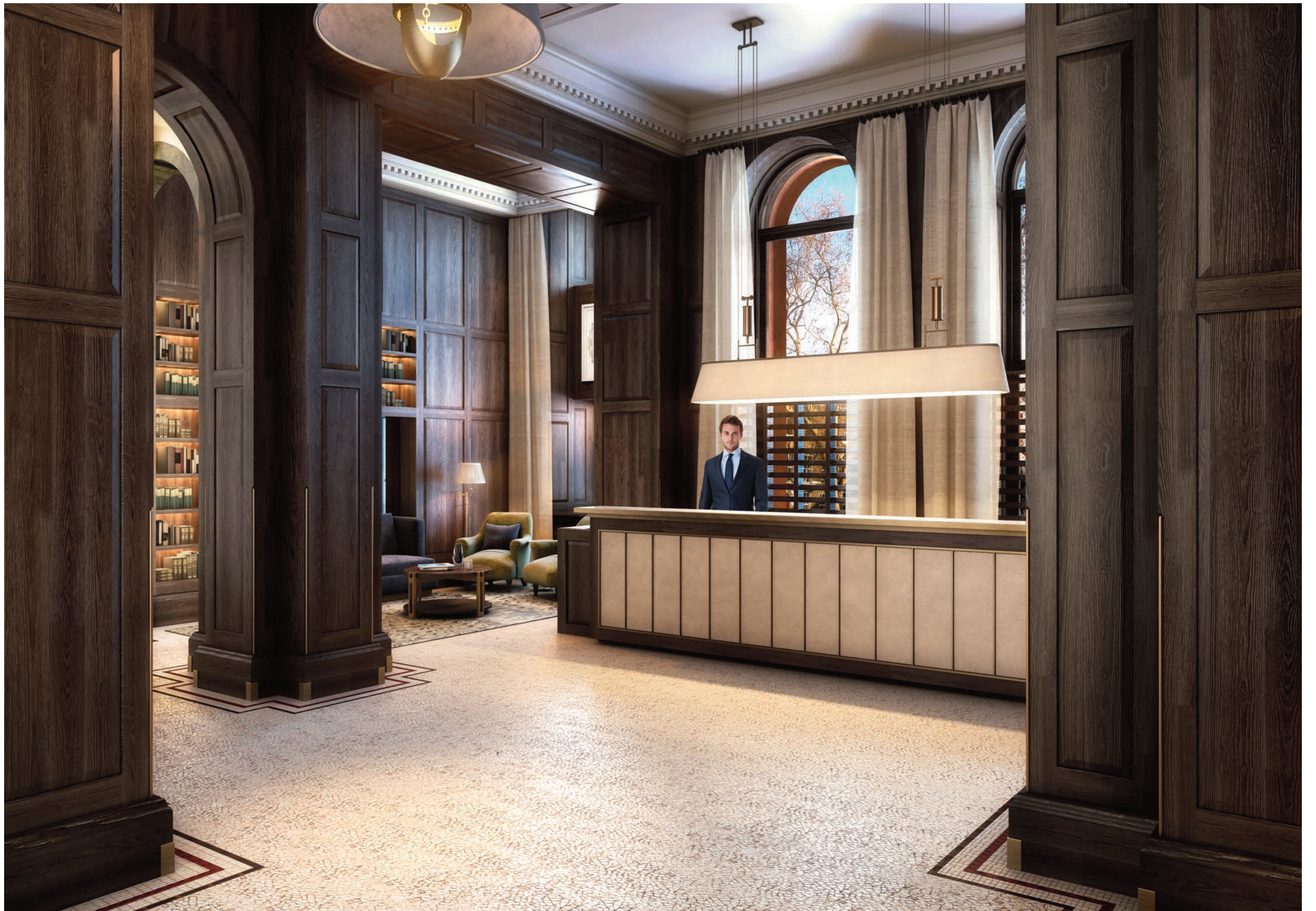
Proposed Reception Visual - Tara Bernerd & Partners