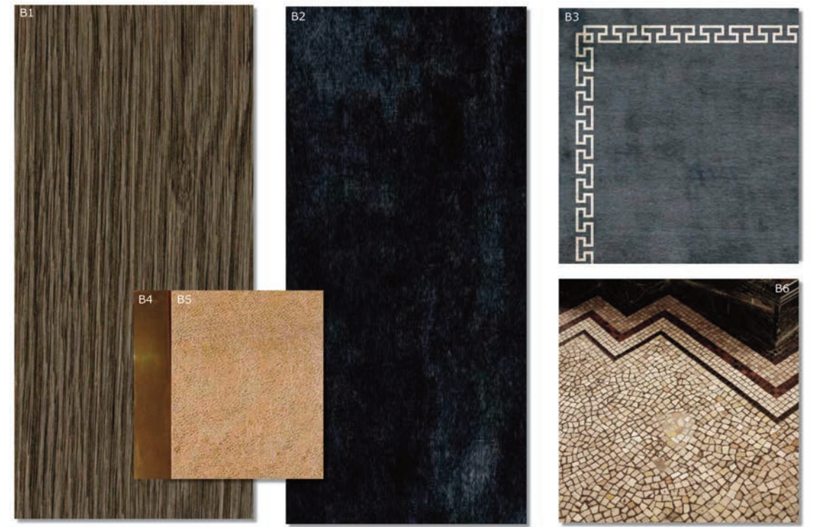
B1. TIMBER | B2. FEATURE DARK PETROL VELVET - FEATURE CURTAINS | B3. RUG | B4. ANTIQUE BRASS | B5. TAN LEATHER - CHAIRS | B6. PARQUET TIMBER FLOOR