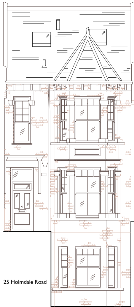
25 Holmdale Road