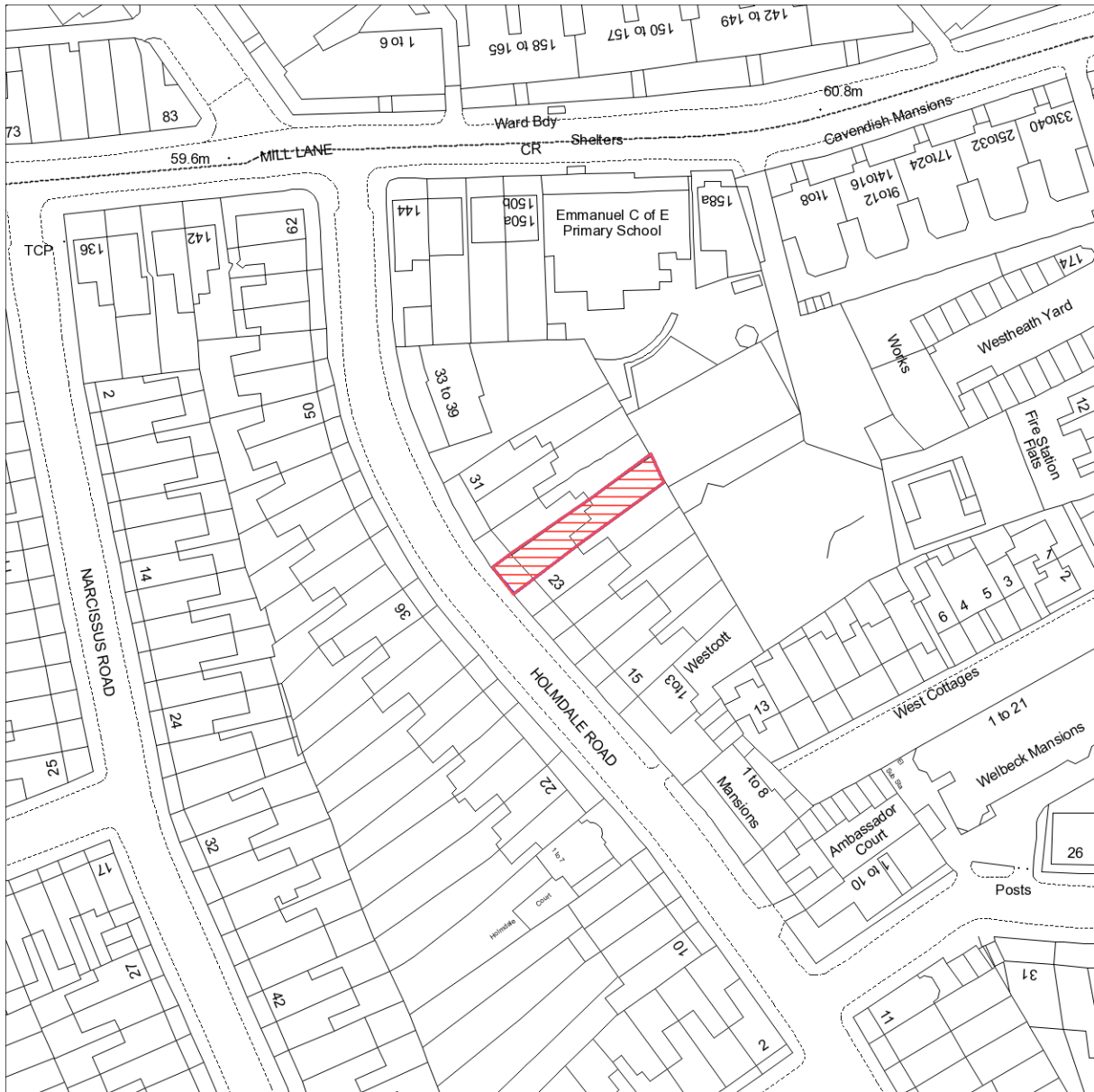
25, Holmdale Road, London