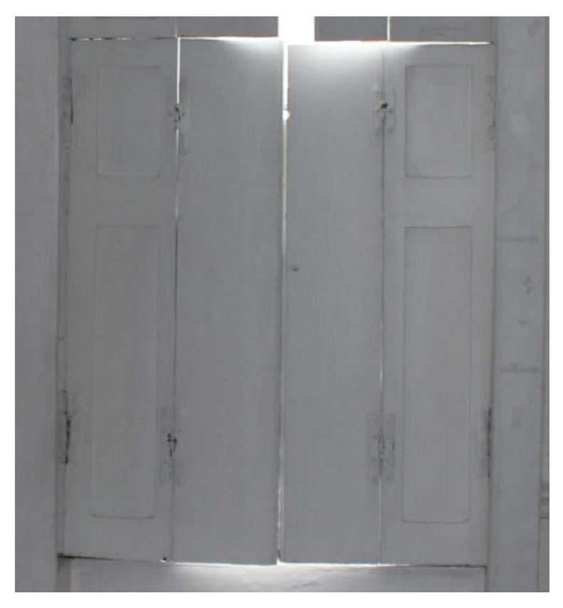
Existing window shutters showing long 'H' profile hinges