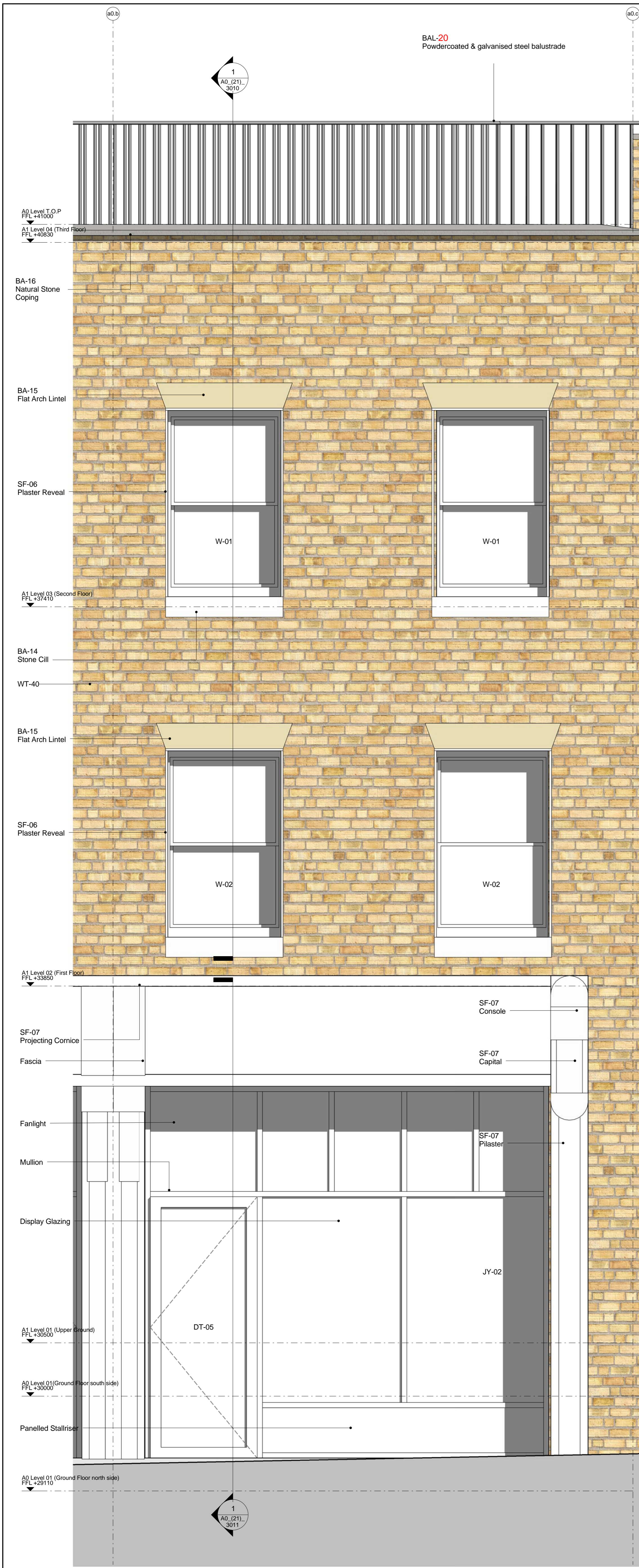
1 Typical Bay Elevation