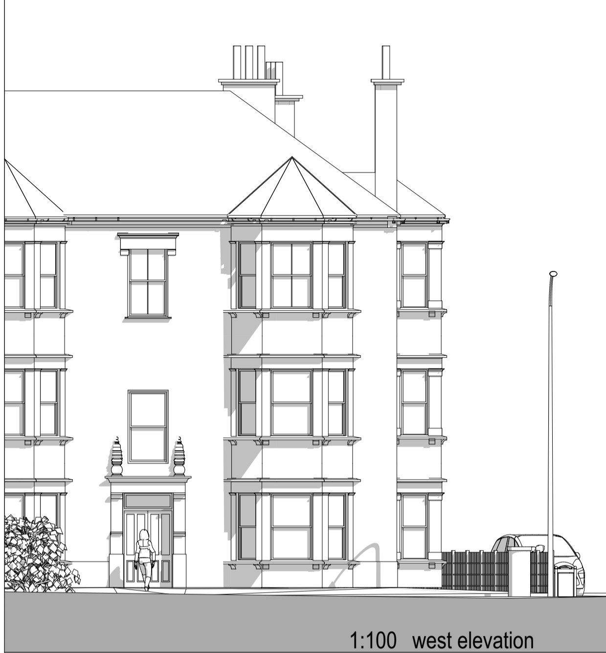
1:100 west elevation