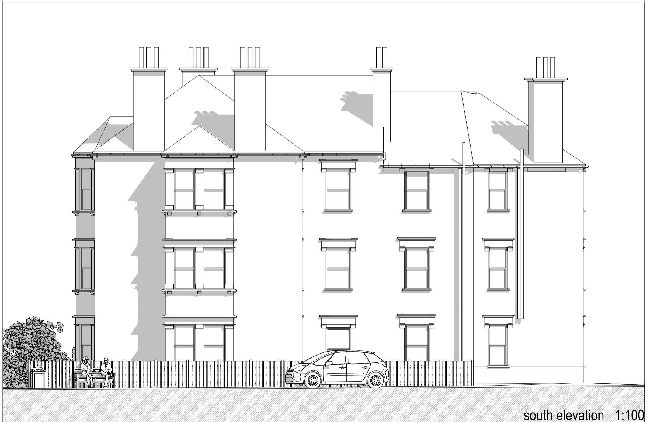
south elevation 1:100