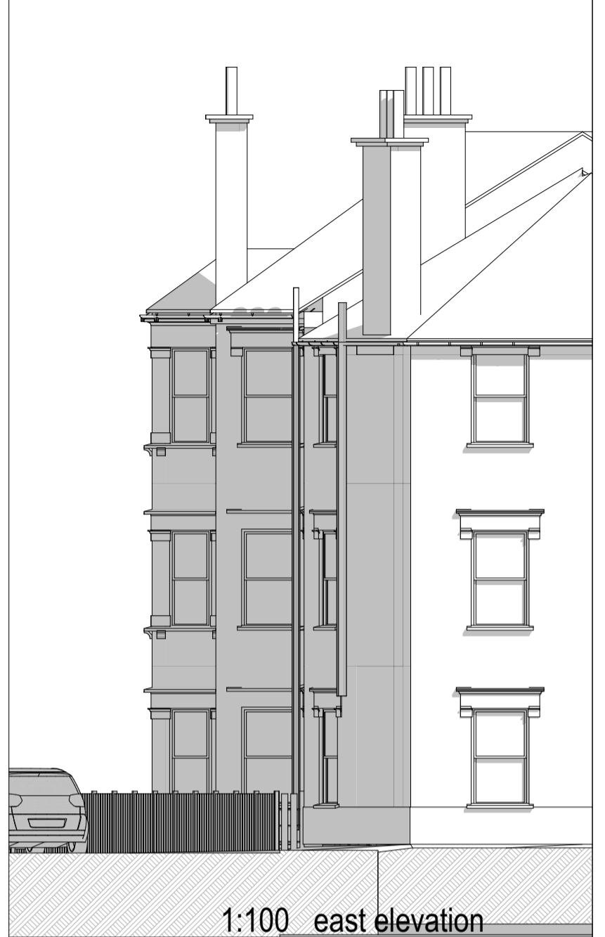
1:100 east elevation