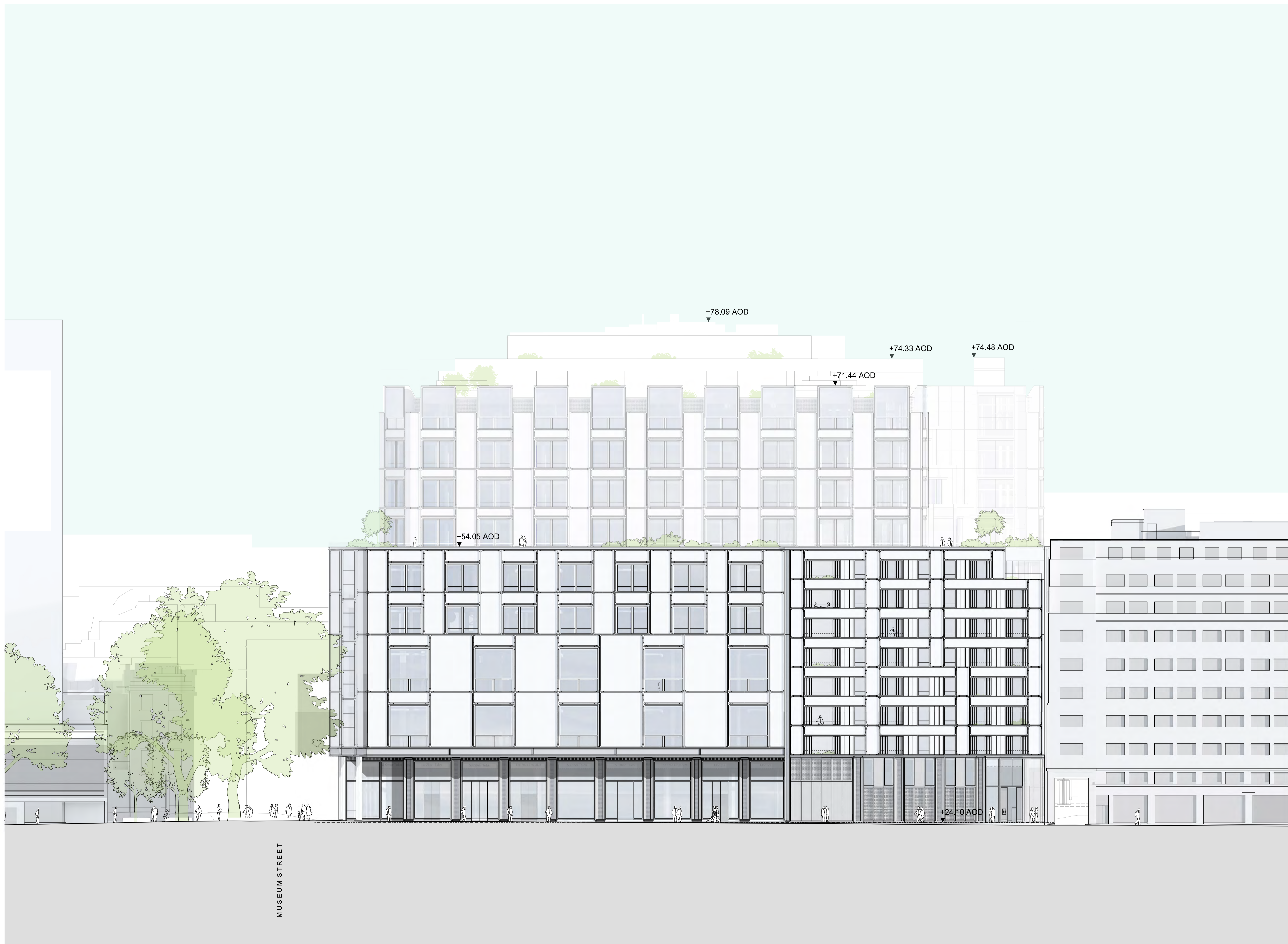
SOUTH ELEVATION - PROPOSED