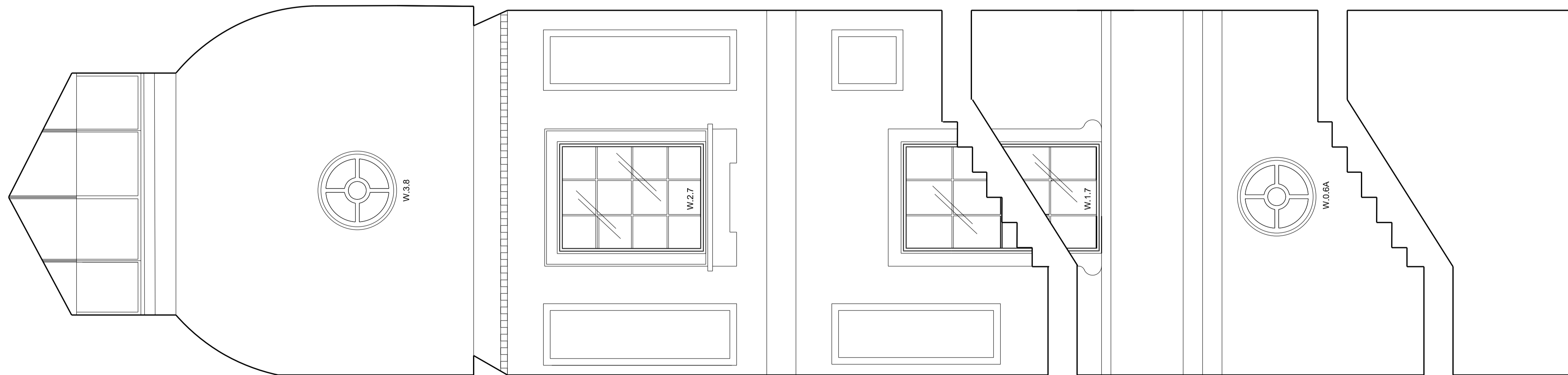
01 MAIN STAIR INTERNAL ELEVATION 1:25