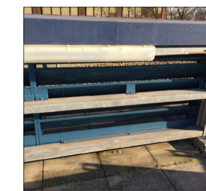
PHOTO 3 - VIEW OF EXISTING INTERNAL FACE OF LOUVERED WALL.