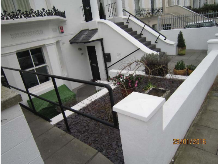
1 – Photograph of 22 Priory Rd

The first is located in the existing extended light-well at the front to provide access to lower ground floor flat. This is similar to other neighbouring properties as shown on the attached photographs.