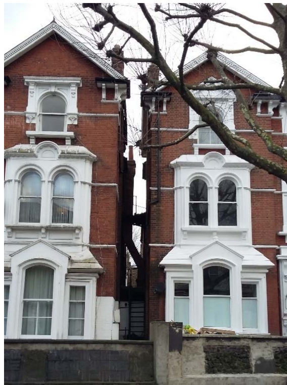
4 – Metal stair in between 129 & 131 West End Lane