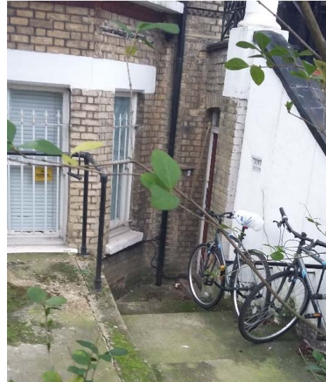
2 – Photograph of 56 West End Lane

The second access is via a new metal stair located to the end of terrace to provide access to the upper ground floor flat. (Refer to proposed side elevation. 1601-P-011). Different properties along West End Lane present access solutions.