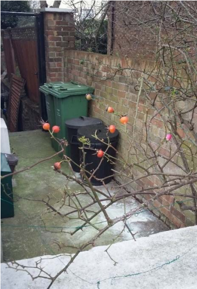
7 – Existing bins location to be retained