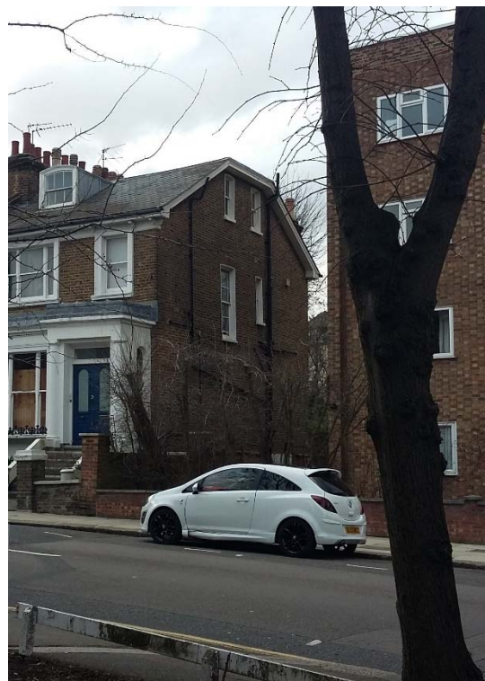
6 – Street view of the side elevation 2

The stepped street access at the front entrance is part of the building's existing historic character and will be retained as access to the existing maisonette located on the First and Second Floor. Provision of access lifts is not deemed suitable or in accordance with protection under the Conservation Area guidelines.