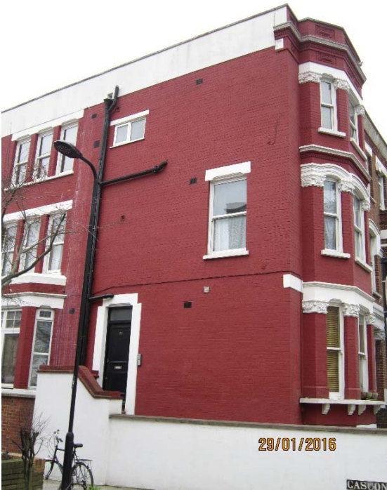
3 – Side access at the corner of West End Lane & Gascon Avenue

The second access is via a new metal stair located to the end of terrace to provide access to the upper ground floor flat. (Refer to proposed side elevation. 1601-P-011). Different properties along West End Lane present access solutions.