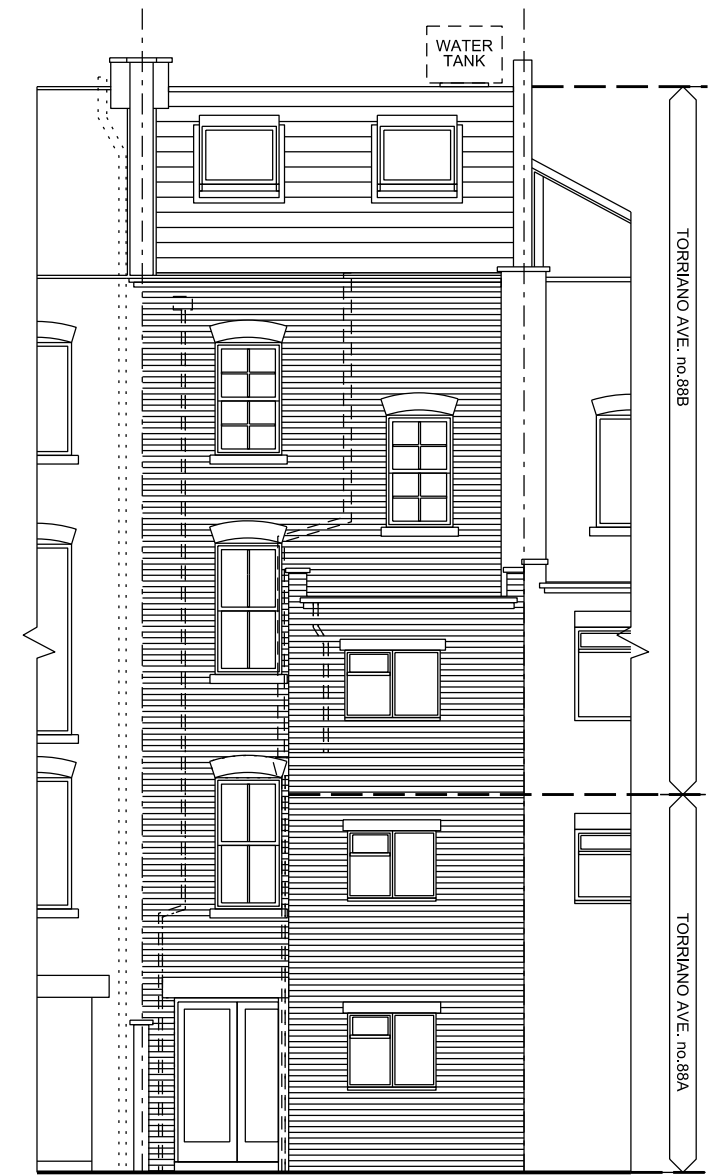
3 REAR ELEVATION SCALE 1:100

NOTES Do not scale-off this drawing. GA take no responsibility for any dimensions obtained by measuring or scaling from this drawing and no reliance may be placed on such dimensions. If no dimension is given, it is the responsibility of the recipient to ascertain the dimension specifically from the Architect or by site measurement.