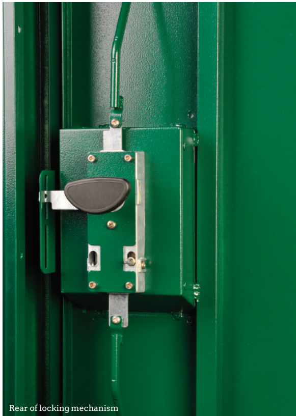
Rear of locking mechanism

Key features and benefits of Asgard storage