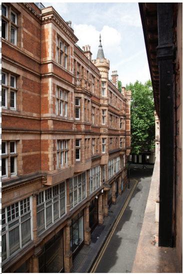
King Edward Mansions