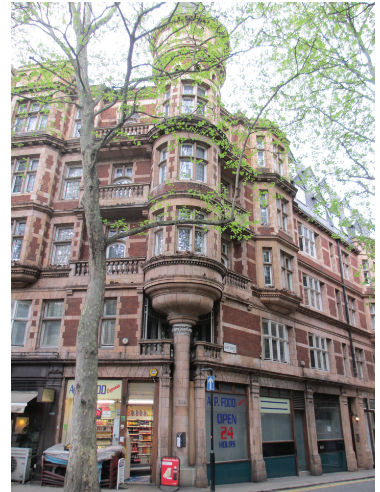
▲ 2: The corner turret of Queen Alexandra Mansions facing Shaftesbury Avenue