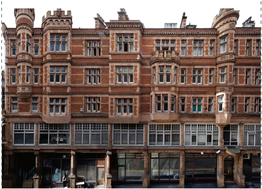
King Edward Mansions