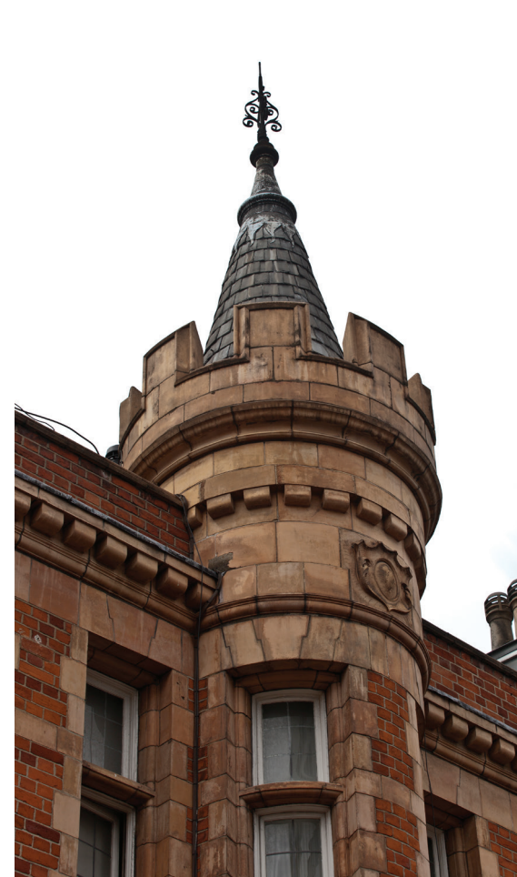
▲ 1: Detail of the exuberant and decorated character of Grape Street