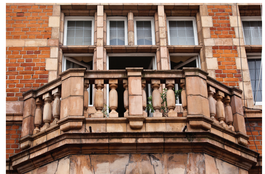
▲ 4: Detail of the exuberant and decorated character of Grape Street