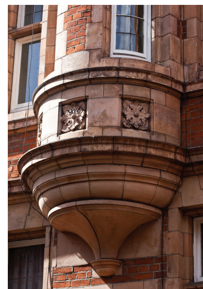
▲ 3: Detail of the exuberant and decorated character of Grape Street