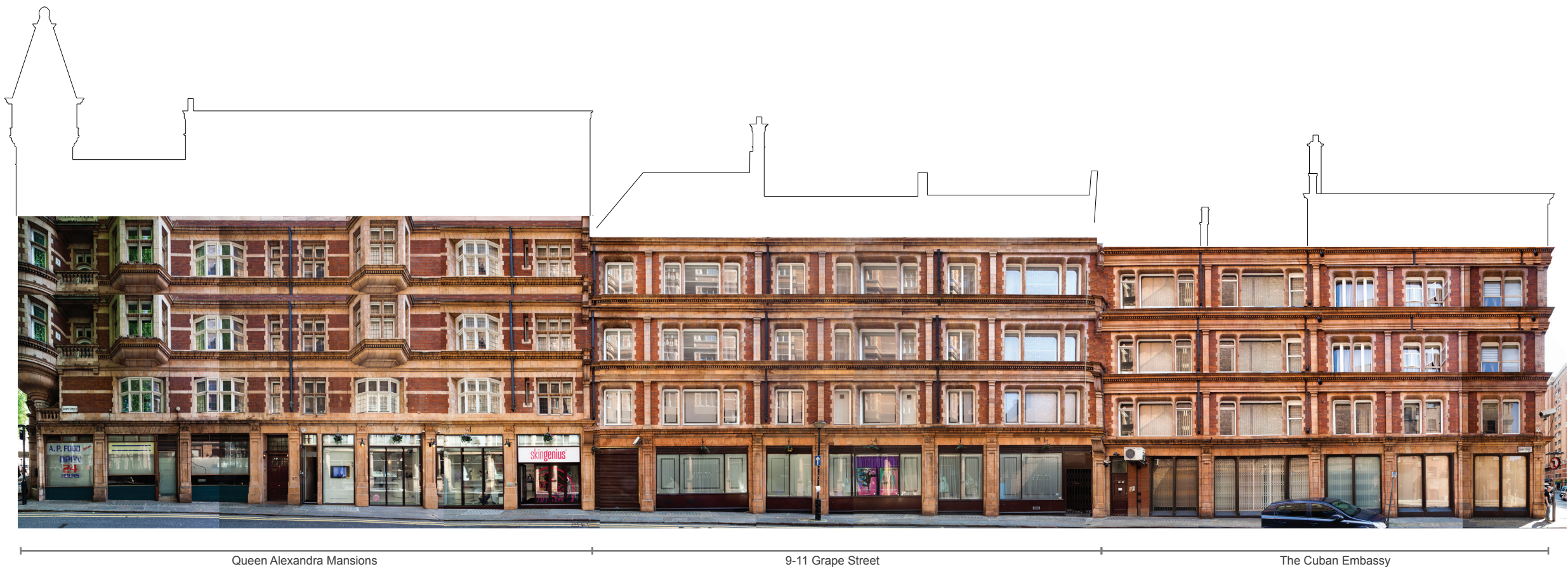
Queen Alexandra Mansions