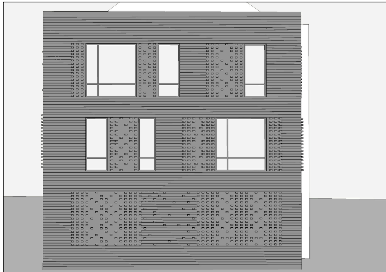
EAST EXTENSION - FACADE DETAIL 1