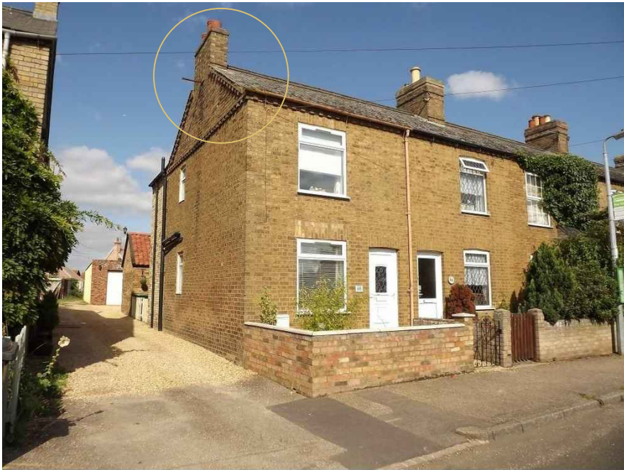
Chimney at the end of a terrace