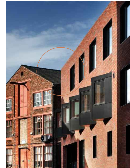
Everyman Theatre showing stretcher bond parapet detail