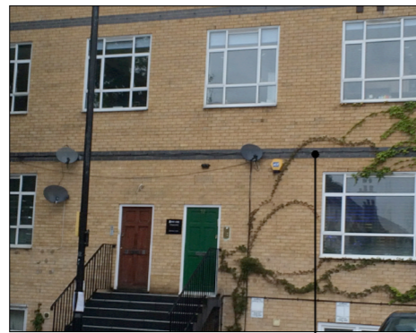
EXISTING GREY BRICK