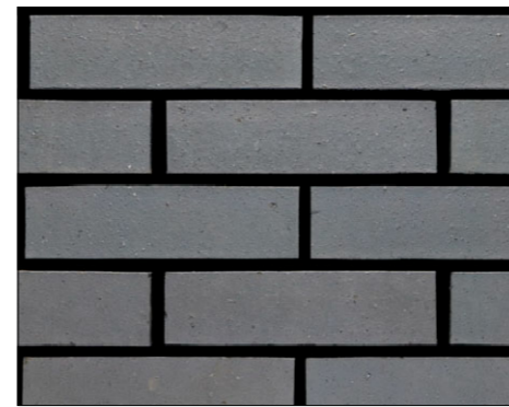
PROPOSED TO MATCH EXISTING GREY BRICK