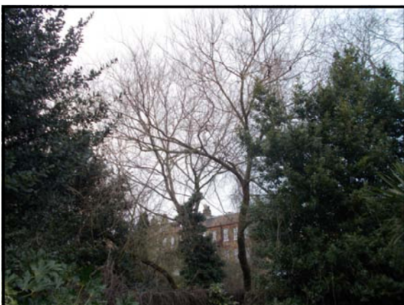
5. T4 left of centre and T3 right of centre.