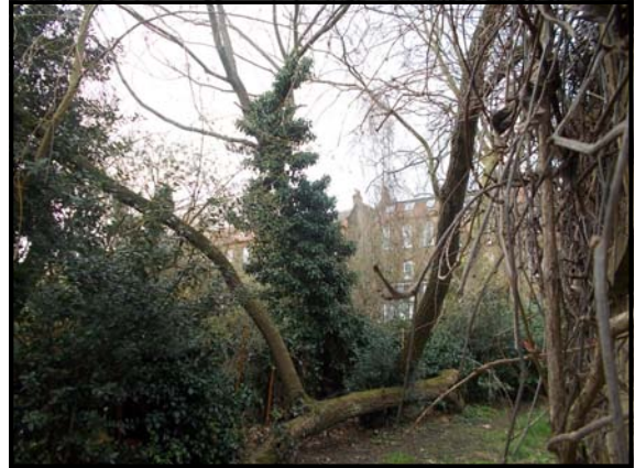
2. T3 stem laying horizontally with T4 showing ivy on stem.