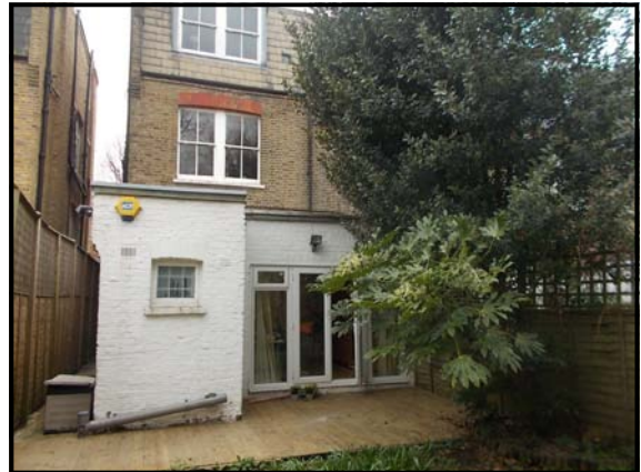
4. Rear of the property showing S1 and T8.