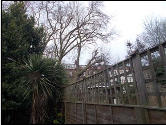
1. T1 right, T2 left behind the policyholder's garden.