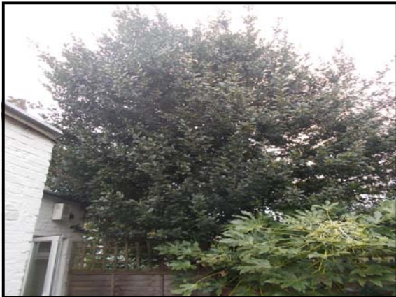
3. View showing T8.