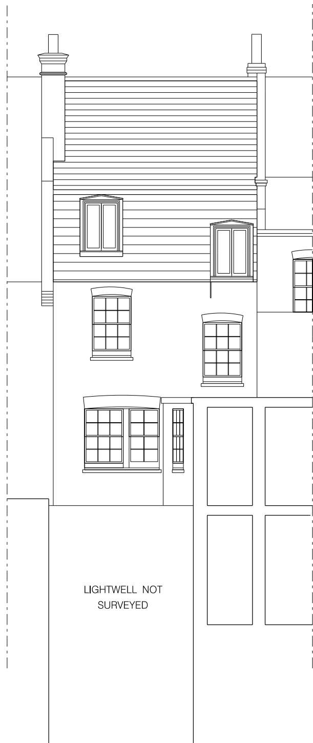
EXISTING SECTION THROUGH LIGHTWELL SHOWING EXISTING REAR ELEVATION