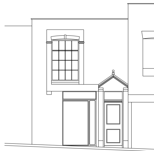
EXISTING HOLLY BUSH VALE ELEVATION