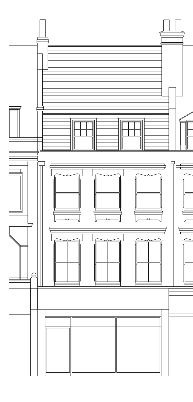
EXISTING HEATH STREET ELEVATION