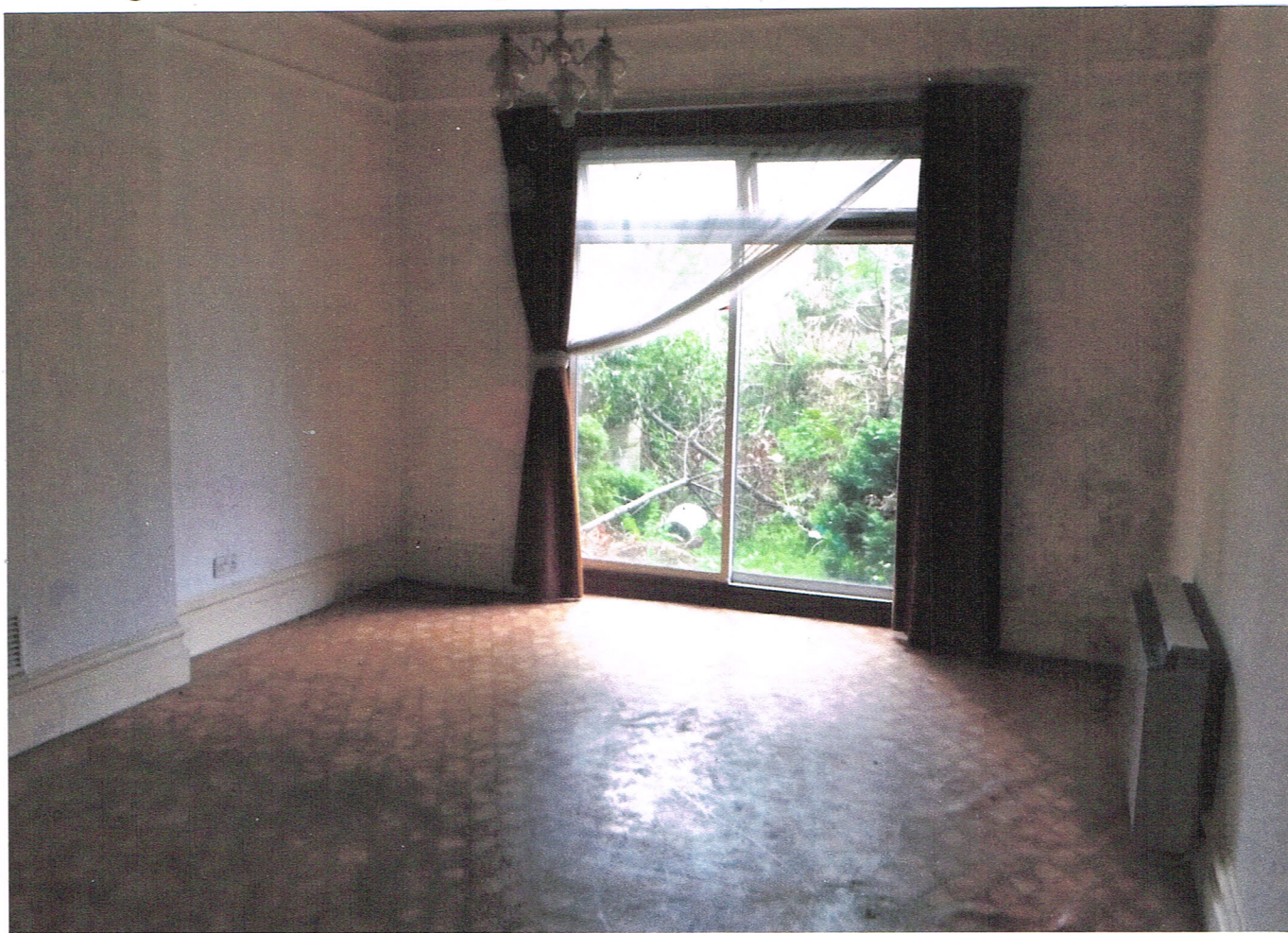
PHOTO 3 - Existing Metal Frame Sliding Patio Doors replaced