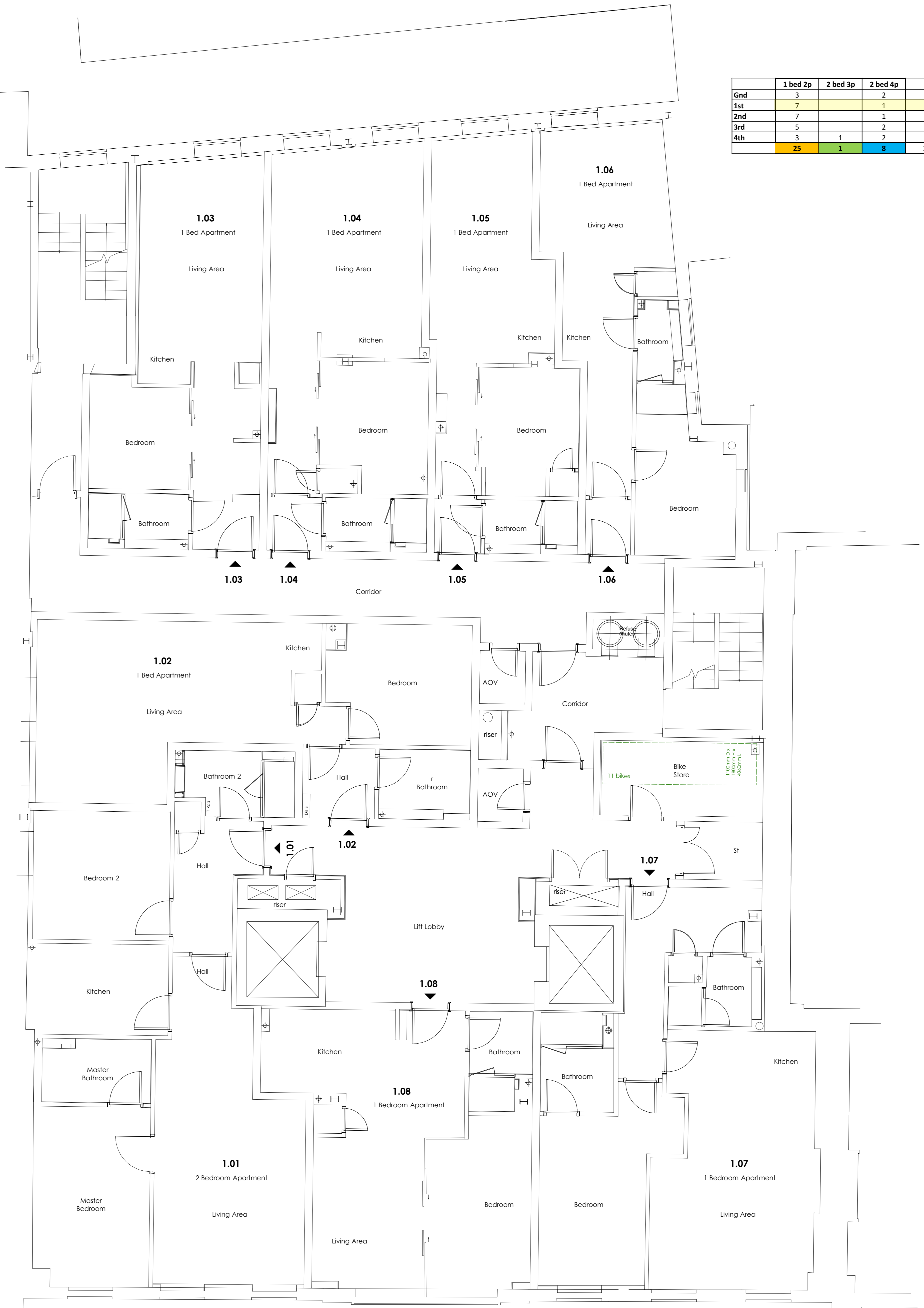
First Floor Plan Scale: 1:100 @ A3

05.04.16 Rev A Bike storage increased in accordance with planning requirements