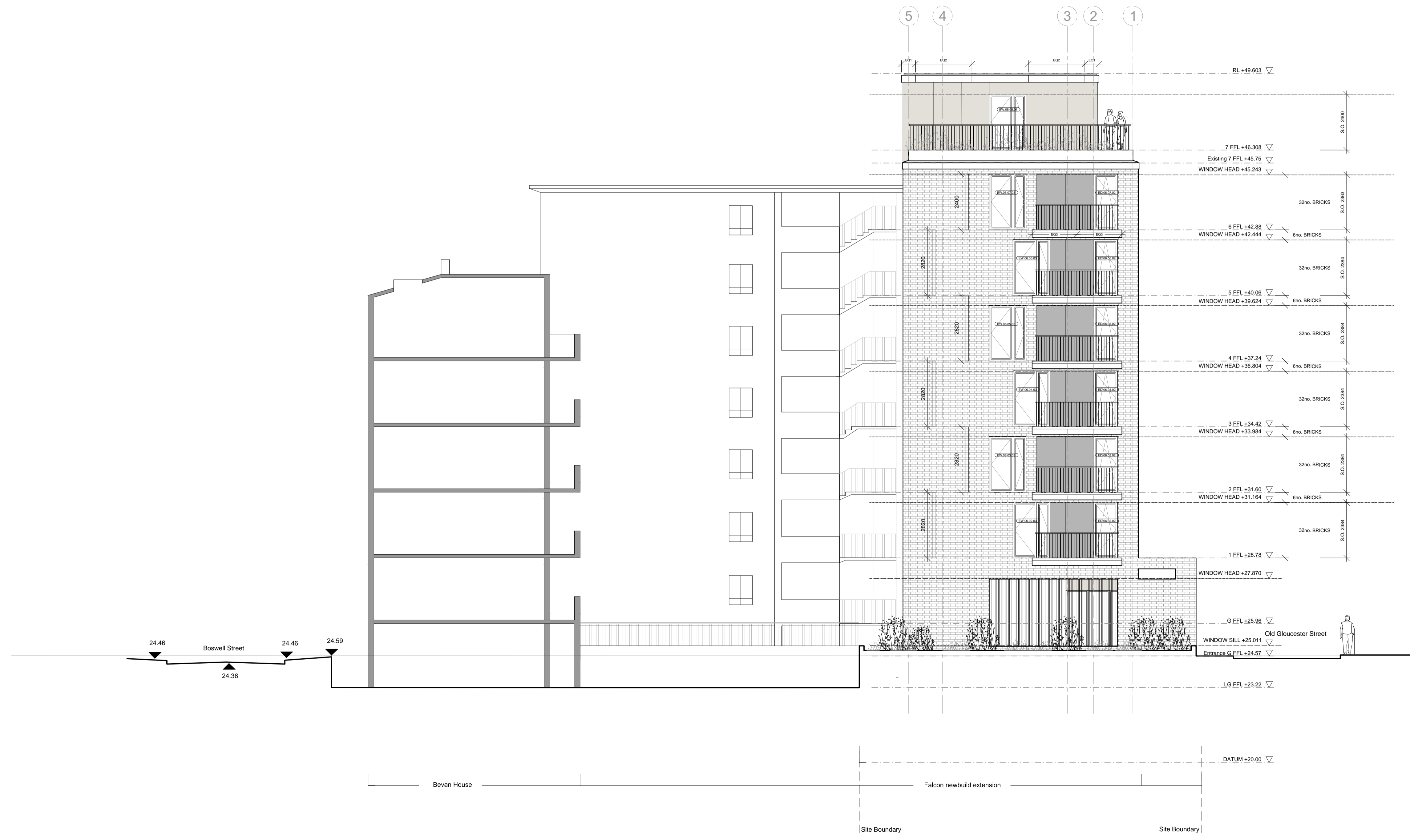
NW Elevation to playground

© Avanti Architects Ltd www.avantiarchitects.co.uk 361-373 City Road + 44 (0) 20 7278 3060 London EC1V 1AS aa@avantiarchitects.co.uk