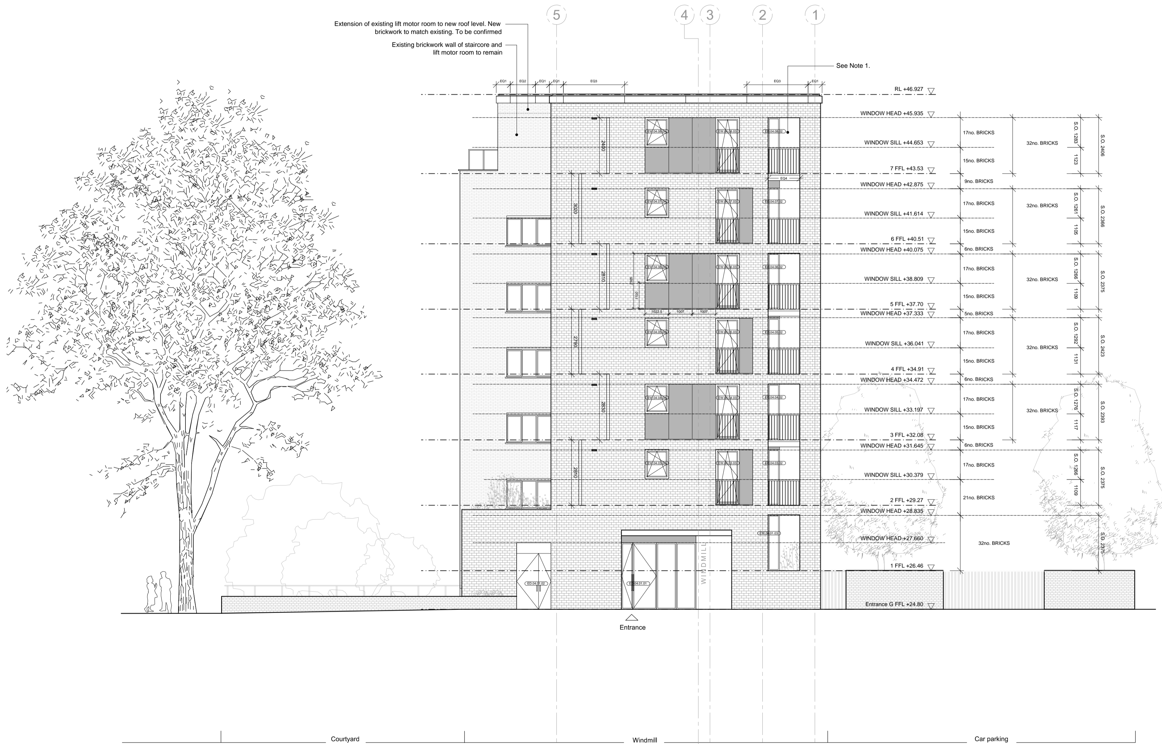
SW Elevation to New North Street

© Avanti Architects Ltd www.avantiarchitects.co.uk 361-373 City Road + 44 (0) 20 7278 3060 London EC1V 1AS aa@avantiarchitects.co.uk