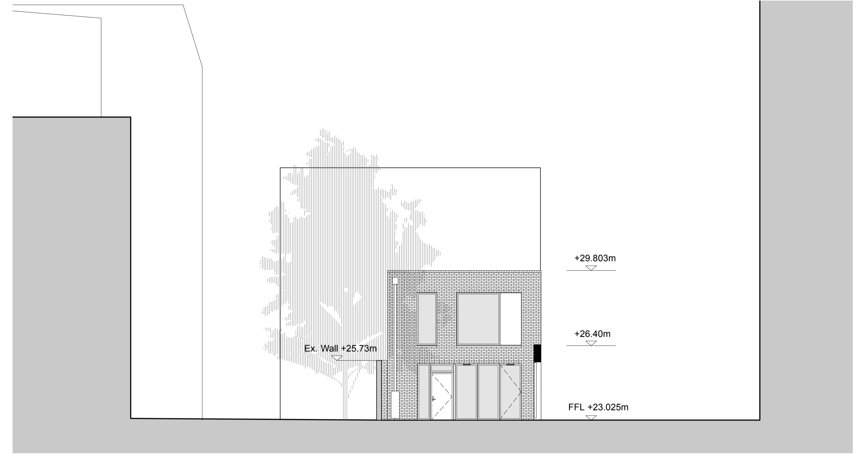
E 03 Elevation 03- Unit 5