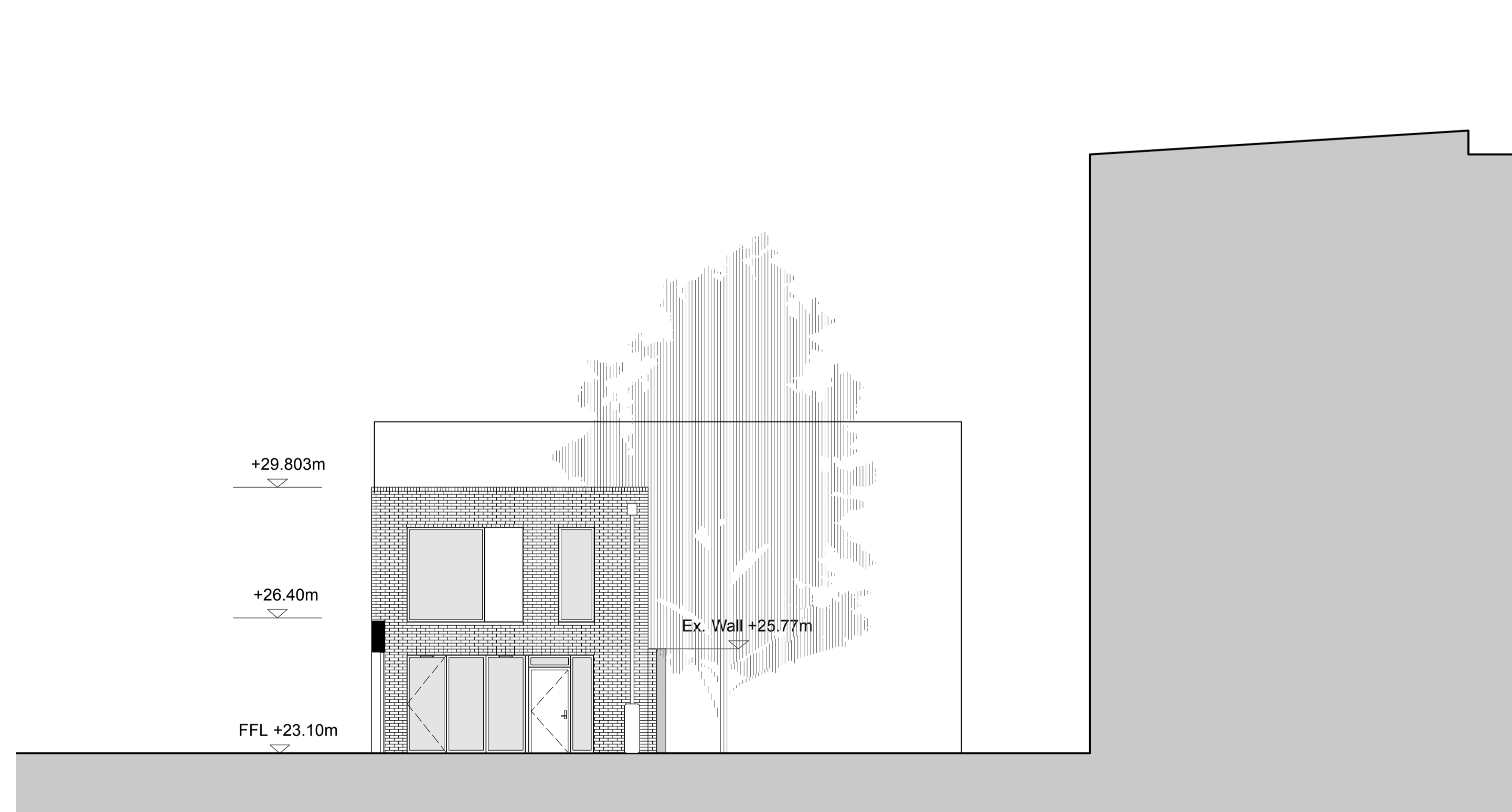
E 04 Elevation 04- Unit 4