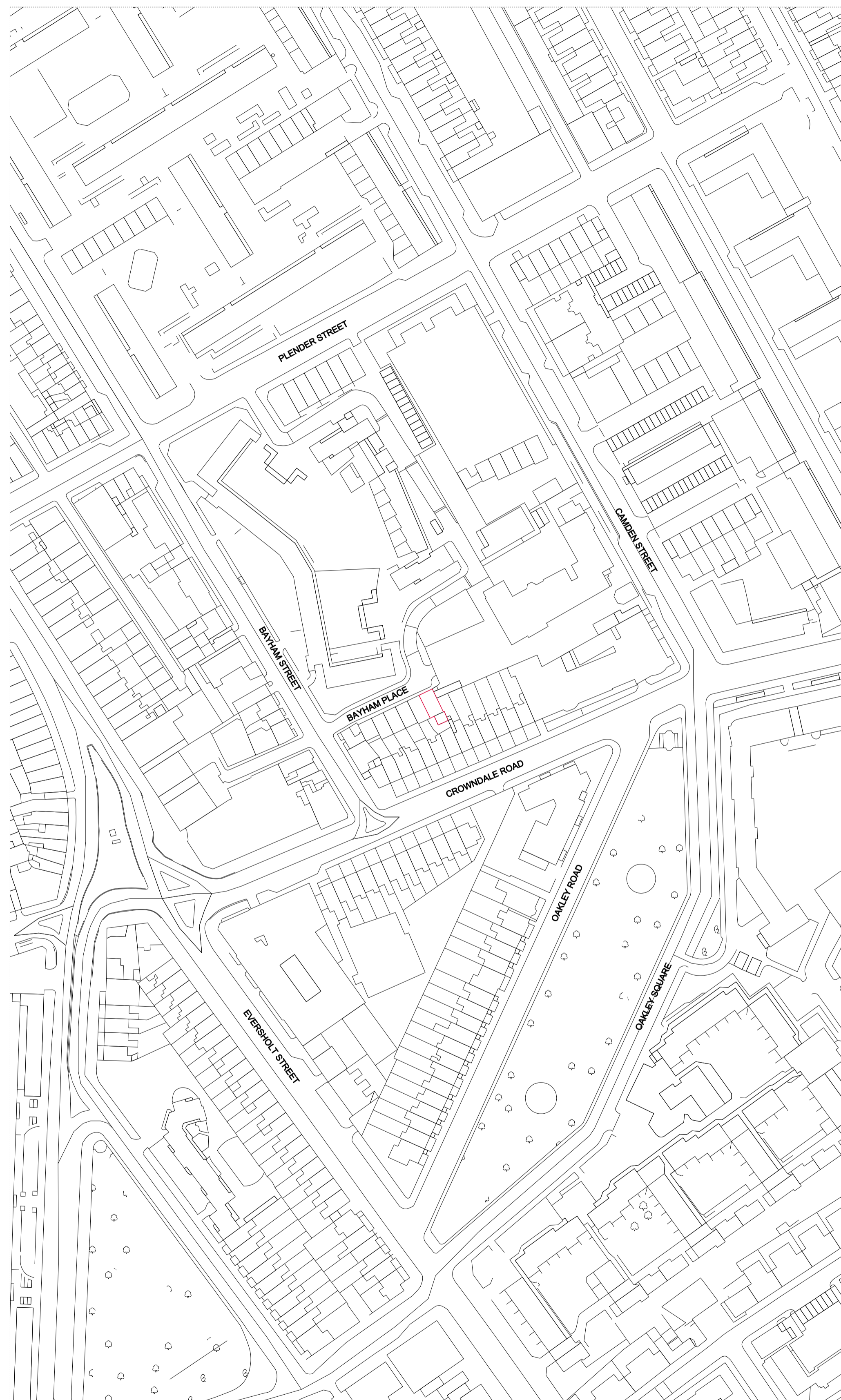
1 1:1250 LOCATION PLAN

THIS DRAWING IS PROTECTED BY COPYRIGHT AND MUST NOT BE COPIED OR REPRODUCED WITHOUT THE WRITTEN CONSENT OF CHRIS DYSON ARCHITECTS LIMITED. NO DIMENSIONS ARE TO BE SCALED FROM THIS DRAWING. ALL DIMENSIONS AND SIZES TO BE CHECKED ON SITE. NORTH POINTS SHOWN ARE INDICATIVE. SITE SPECIFIC HAZARDS IN ACCORDANCE WITH THE REQUIREMENTS OF THE CDM REGULATIONS 2007 THE FOLLOWING SIGNIFICANT RESIDUAL HAZARDS HAVE NOT BEEN DESIGNED OUT OF THIS PROJECT AND MUST BE TAKEN INTO CONSIDERATION BY CONTRACTORS PLANNING TO UNDERTAKE THE WORKS SHOWN ON THIS DRAWING: