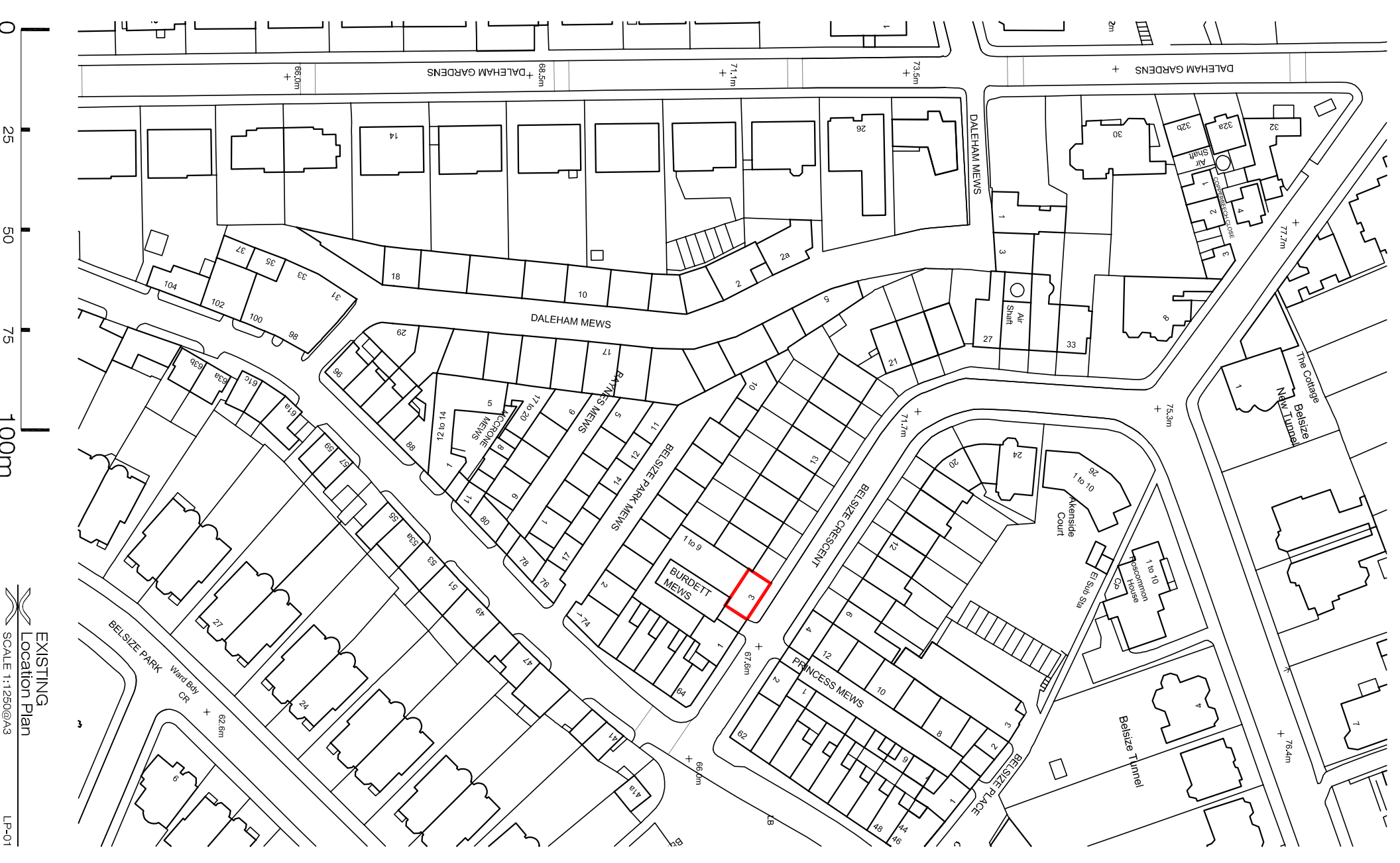
EXISTING Location Plan SCALE 1:1250@A3 LP-01