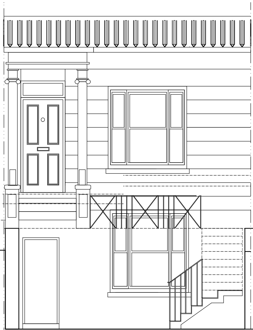
(Part) Existing Front Elevation