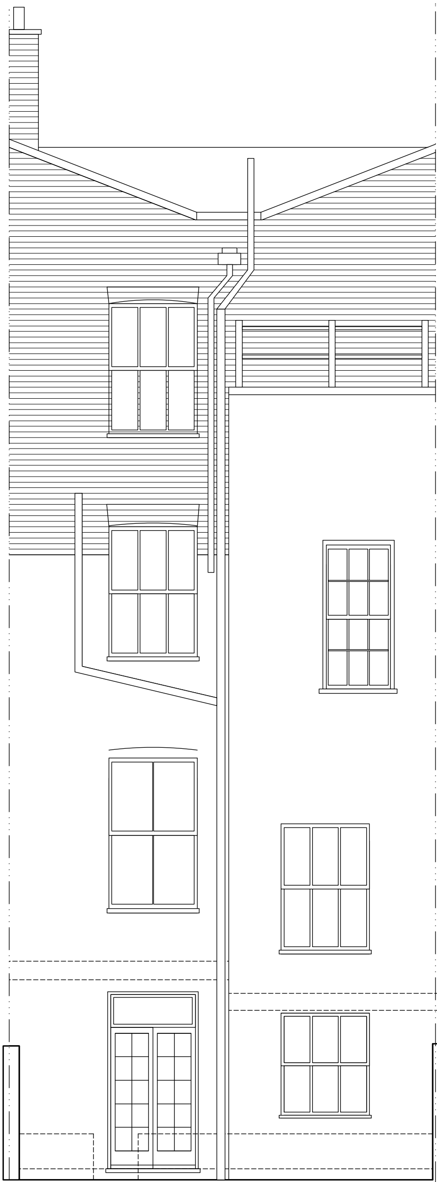
Rear Existing Elevation