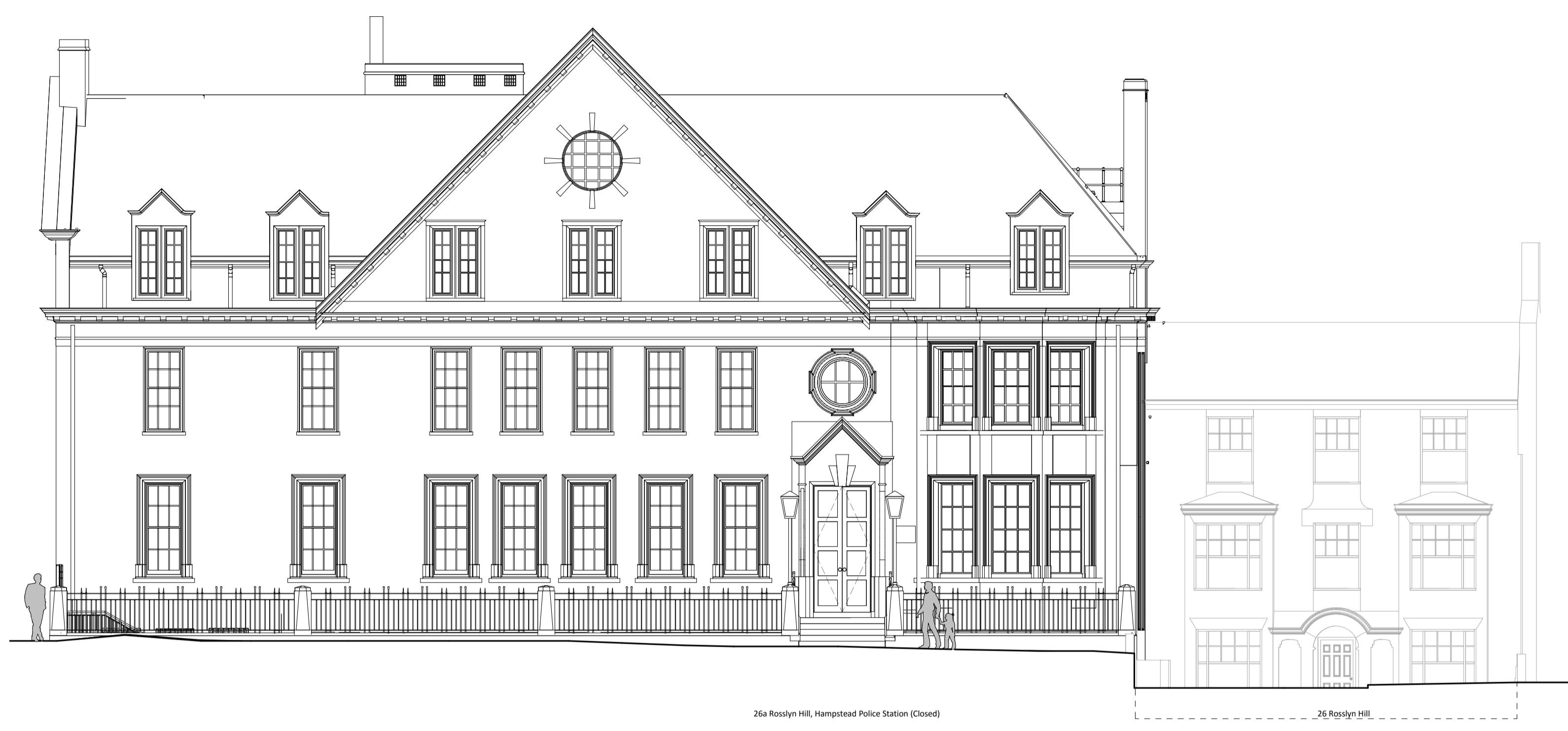
Proposed South West elevation A 1 : 100

NOTE DO NOT SCALE FROM THIS DRAWING. FIGURED DIMENSIONS ONLY ARE TO BE TAKEN FROM THIS DRAWING. ALL DIMENSIONS ARE IN MILLIMETRES UNLESS OTHERWISE STATED. CONTRACTOR TO CHECK AND CONFIRM ALL DIMENSIONS AND SETTING OUT ON SITE. REPORT ANY ERRORS OR OMISSIONS TO WGI. EXISTING INFORMATION BASED ON SURVEY MODEL RECEIVED 2015-10-20 (MODEL REF "32624RM-01-WP", "32624RM-02-WP", "32624RM-03-WP", "32624RM-04-WP") SURVEY MODEL IS PARTIALLY INCOMPLETE AND REQUIRES UPDATE FROM SURVEYOR. PROPERTY LINE SHOWN IS TO BE CONFIRMED. CURRENT MODEL FILE NAME - 114031-WGI-00-ZZ-M3-A-0001 CURRENT MODEL REVISION - 1