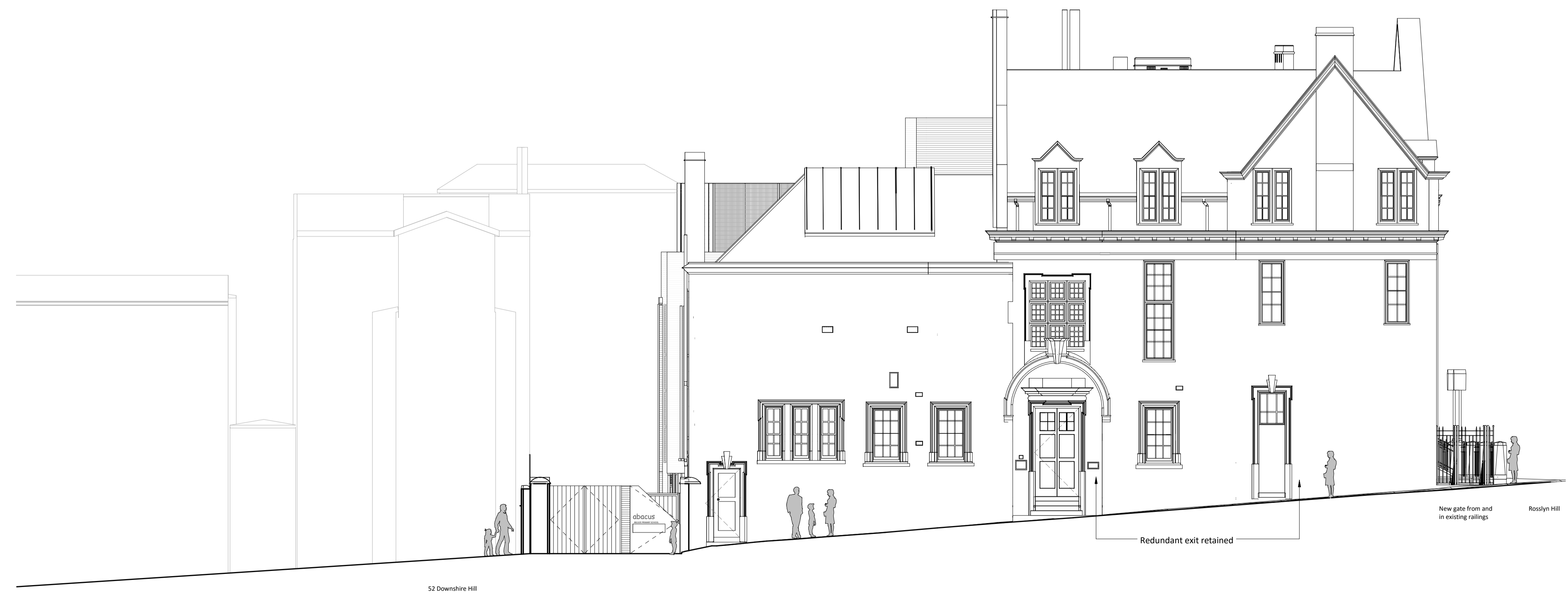
Proposed North West Elevation 1 : 100