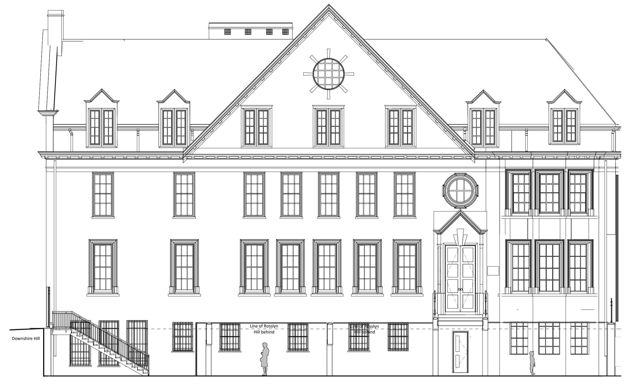
Proposed South West Elevation B 1 : 100