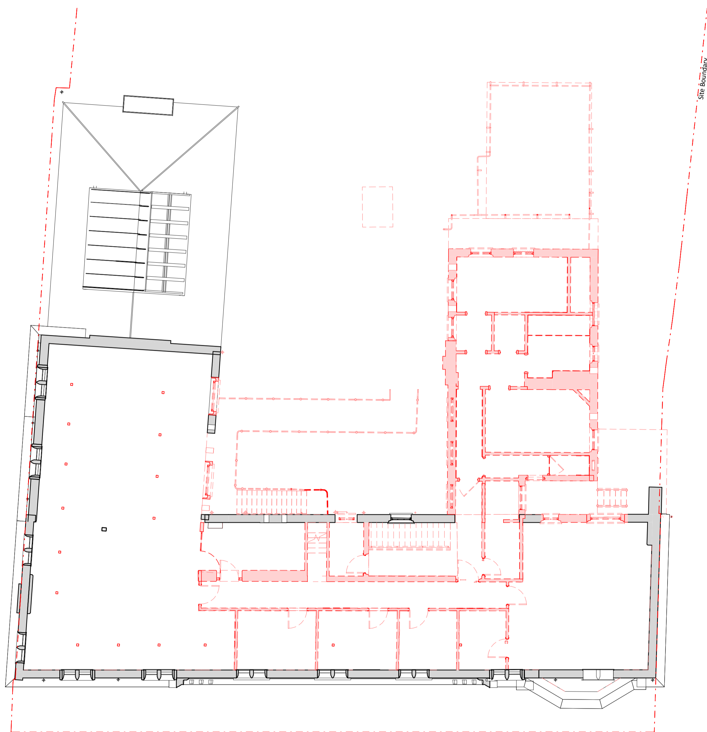
Demolition Plan - Second Floor Level 1 : 100

NOTE DO NOT SCALE FROM THIS DRAWING. FIGURED DIMENSIONS ONLY ARE TO BE TAKEN FROM THIS DRAWING. ALL DIMENSIONS ARE IN MILLIMETRES UNLESS OTHERWISE STATED. CONTRACTOR TO CHECK AND CONFIRM ALL DIMENSIONS AND SETTING OUT ON SITE. REPORT ANY ERRORS OR OMISSIONS TO WGI. EXISTING INFORMATION BASED ON SURVEY MODEL RECEIVED 2015-10-20 (MODEL REF "32624RM-01-WP", "32624RM-02-WP", "32624RM-03-WP", "32624RM-04-WP") SURVEY MODEL IS PARTIALLY INCOMPLETE AND REQUIRES UPDATE FROM SURVEYOR. PROPERTY LINE SHOWN IS TO BE CONFIRMED CURRENT MODEL FILE NAME - 114031-WGI-00-ZZ-M3-A-0001 CURRENT MODEL REVISION - 1