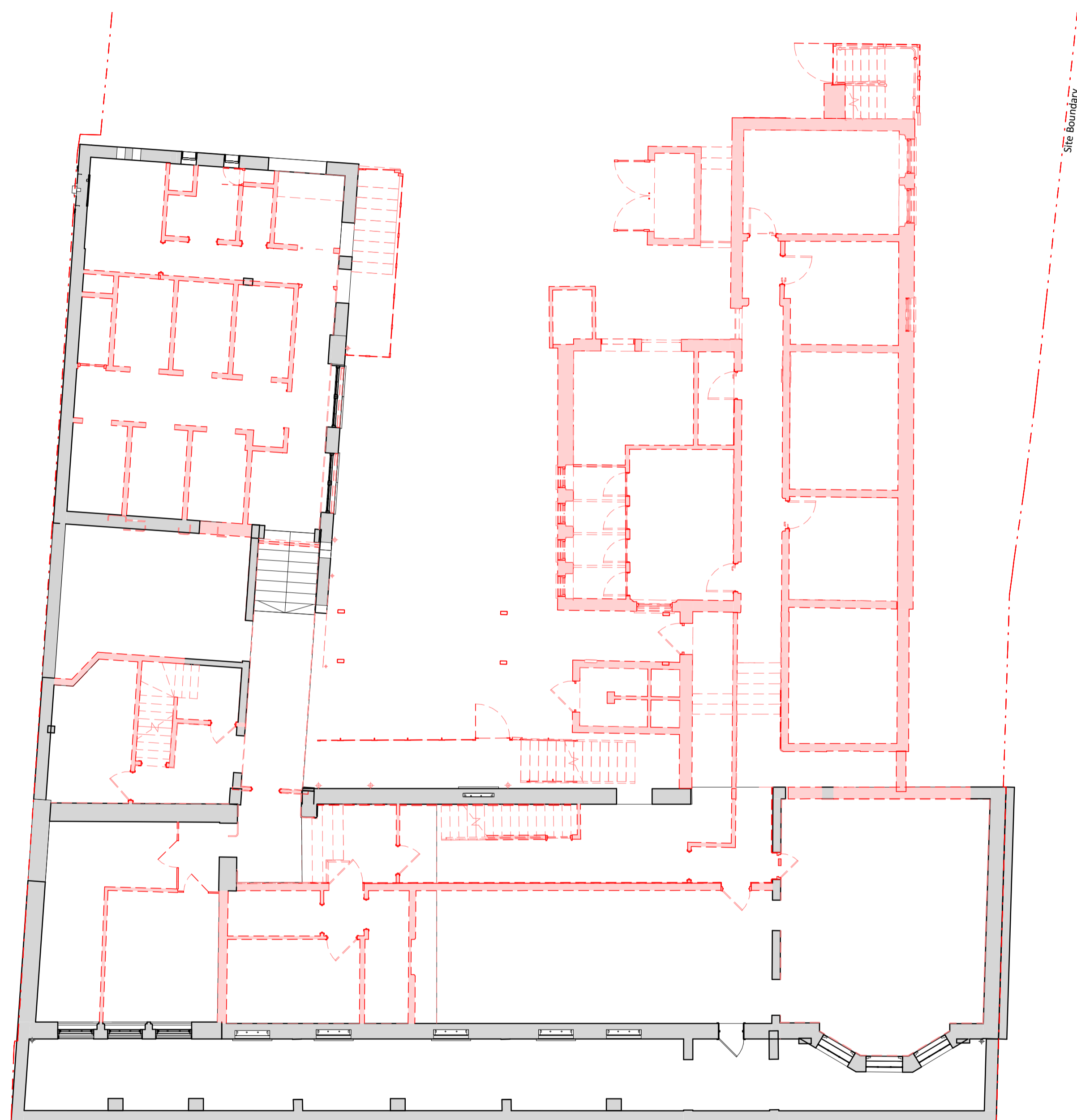
Demolition Plan - Lower Ground Floor 1 : 100

NOTE DO NOT SCALE FROM THIS DRAWING. FIGURED DIMENSIONS ONLY ARE TO BE TAKEN FROM THIS DRAWING. ALL DIMENSIONS ARE IN MILLIMETRES UNLESS OTHERWISE STATED. CONTRACTOR TO CHECK AND CONFIRM ALL DIMENSIONS AND SETTING OUT ON SITE. REPORT ANY ERRORS OR OMISSIONS TO WGI. EXISTING INFORMATION BASED ON SURVEY MODEL RECEIVED 2015-10-20 (MODEL REF "32624RM-01-WP", "32624RM-02-WP", "32624RM-03-WP", "32624RM-04-WP") SURVEY MODEL IS PARTIALLY INCOMPLETE AND REQUIRES UPDATE FROM SURVEYOR. PROPERTY LINE SHOWN IS TO BE CONFIRMED CURRENT MODEL FILE NAME -114031-WGI-00-ZZ-M3-A-0001 CURRENT MODEL REVISION - 1