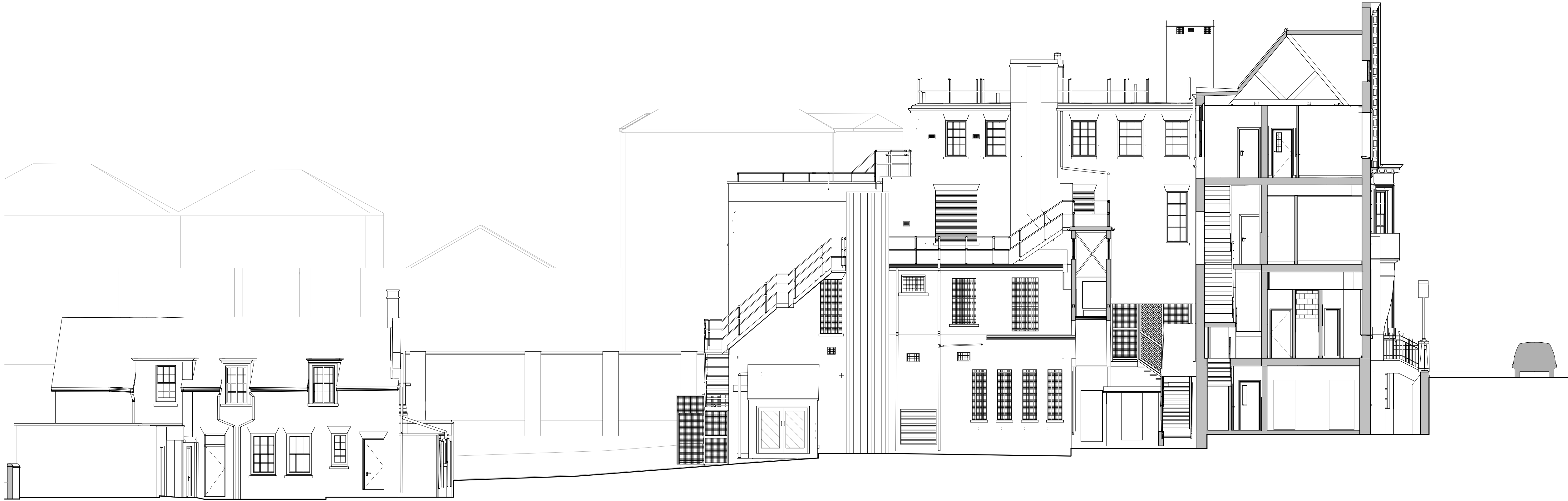
Existing Stable Block

NOTE DO NOT SCALE FROM THIS DRAWING. FIGURED DIMENSIONS ONLY ARE TO BE TAKEN FROM THIS DRAWING. ALL DIMENSIONS ARE IN MILLIMETRES UNLESS OTHERWISE STATED. CONTRACTOR TO CHECK AND CONFIRM ALL DIMENSIONS AND SETTING OUT ON SITE. REPORT ANY ERRORS OR OMISSIONS TO WGI. EXISTING INFORMATION BASED ON SURVEY MODEL RECEIVED 2015-10-20 (MODEL REF "32624RM-01-WIP", "32624RM-02-WIP", "32624RM-03-WIP", "32624RM-04-WIP") SURVEY MODEL IS PARTIALLY INCOMPLETE AND REQUIRES UPDATE FROM SURVEYOR. PROPERTY LINE SHOWN IS TO BE CONFIRMED CURRENT MODEL FILE NAME - 114031-WGI-00-ZZ-M3-A-0001 CURRENT MODEL REVISION - 1