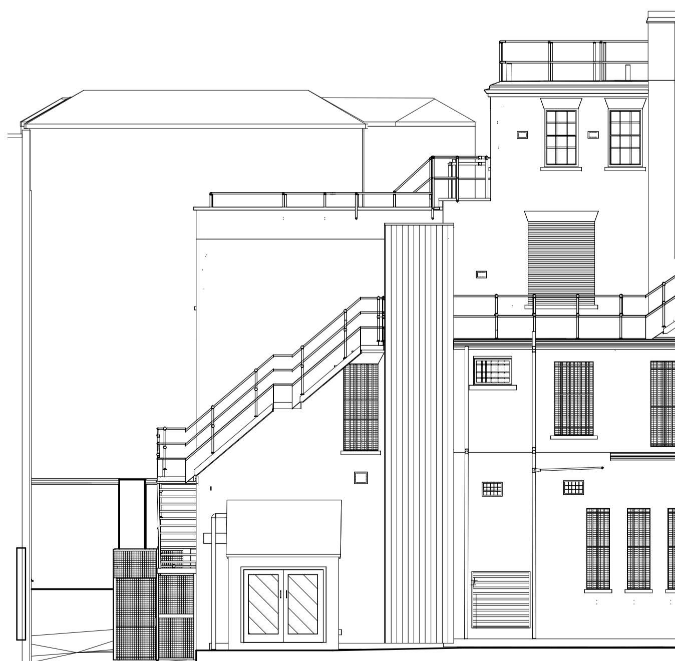
Existing North West Elevation B 1 : 100