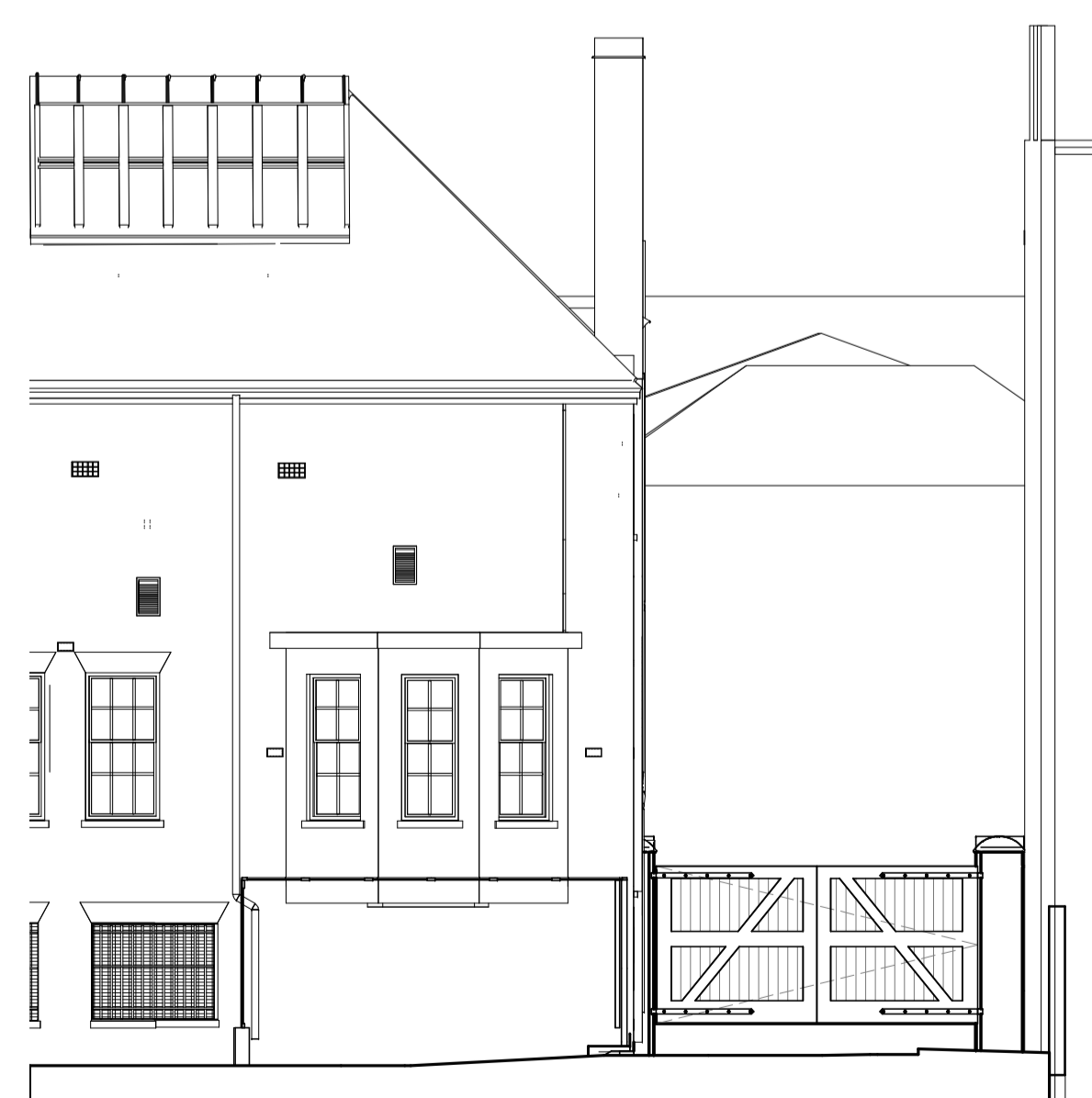
Existing South East Elevation 1 : 100