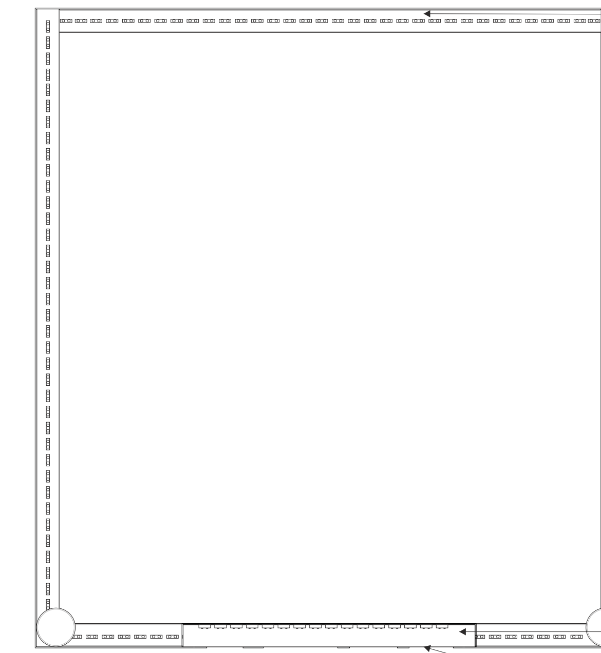
Proposed canopy sign plan Scale 1:10 at A0