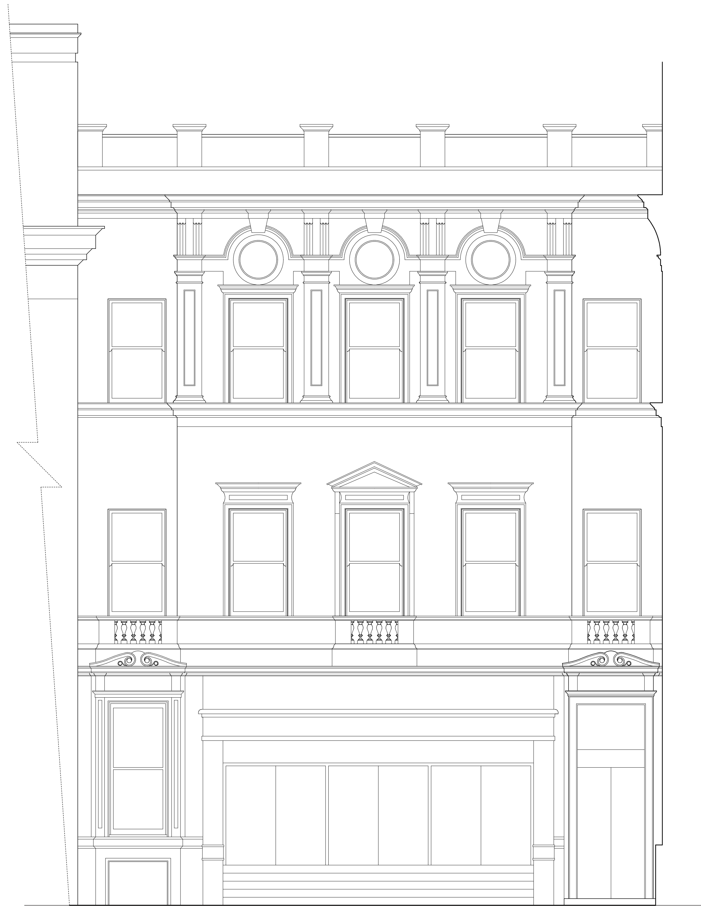
Existing front elevation Scale 1:50