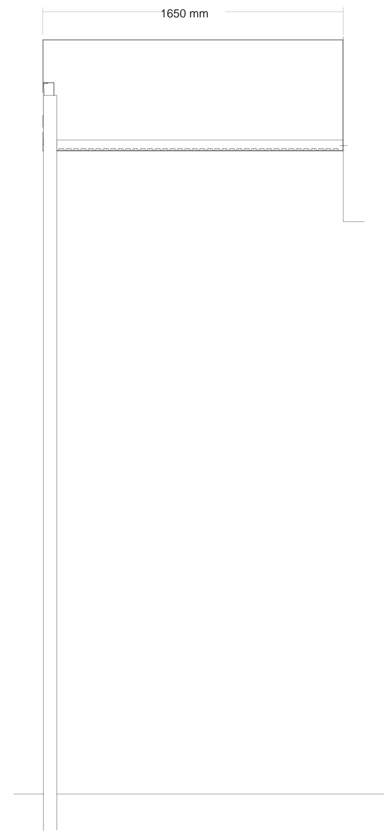
Proposed canopy sign section Scale 1:10 at A0