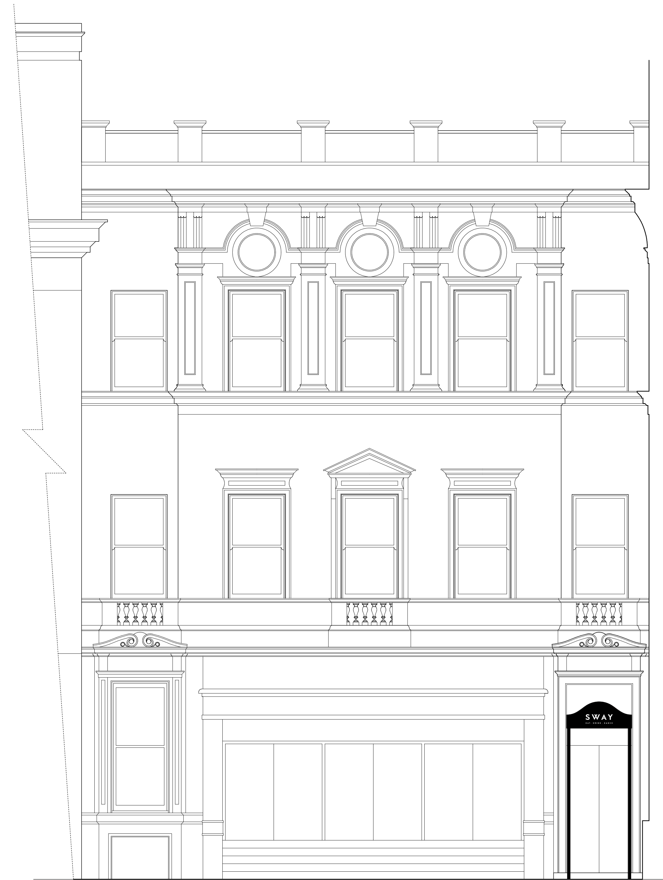
Proposed front elevation Scale 1:50