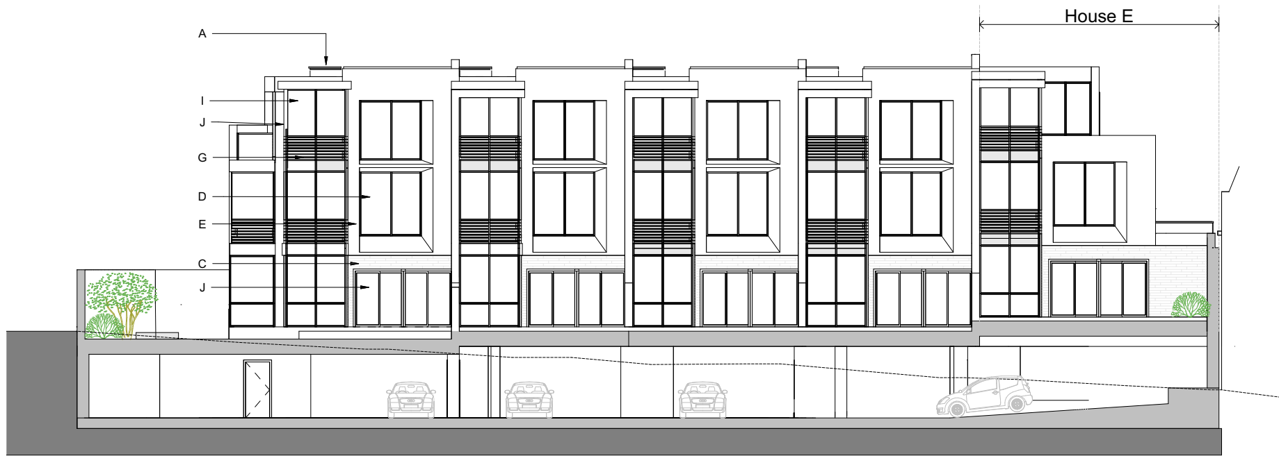
WEST ELEVATION (BACK) PRIVATE GARDENS 1 : 200

Notes: Do not Scale from this drawing Use figured dimensions only This scheme is subject to all necessary consents. Dimensions, areas and levels where given are approximate and subject to site survey. All dimensions are to be checked on site. Any discrepancies are to be reported to the architect before the work commences. Figured dimensions only are to be taken from this drawing. This drawing is to be read in conjunction with all relevant consultants' and/or specialists drawings/documents and any discrepancies or variations are to be notified to the architect before the affected work commences.