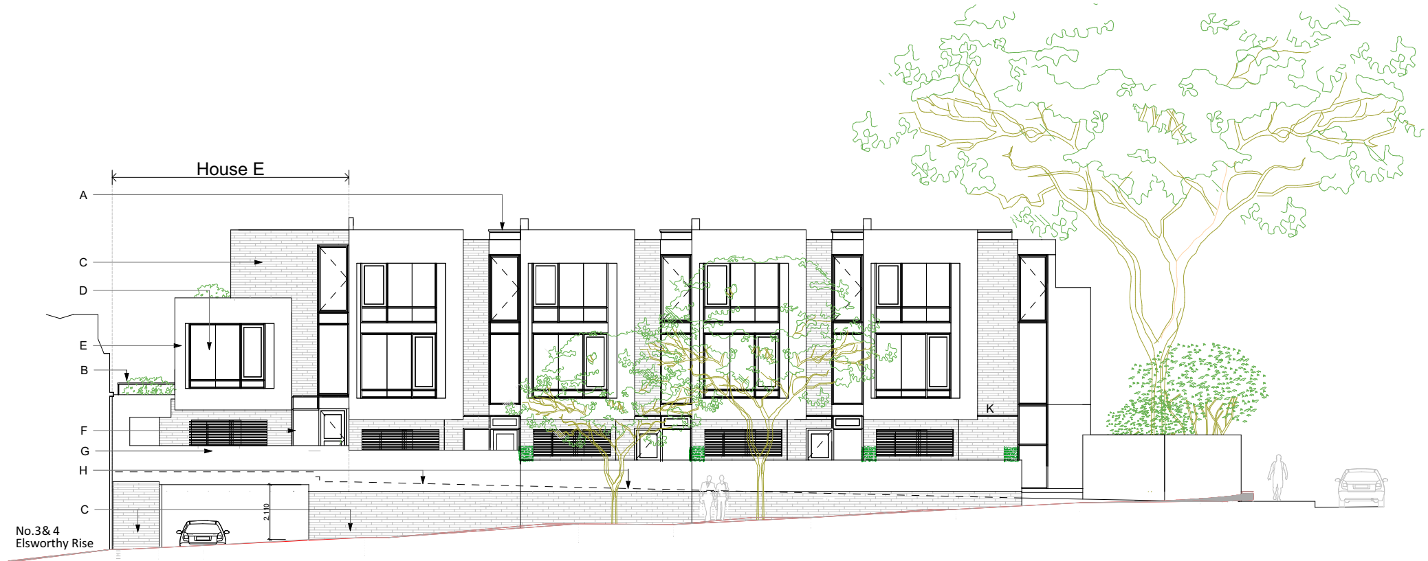
EAST ELEVATION (FRONT) ELSWORTHY RISE 1 : 200