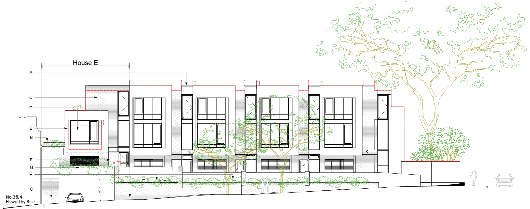
EAST ELEVATION (FRONT) ELSWORTHY RISE 1 : 200