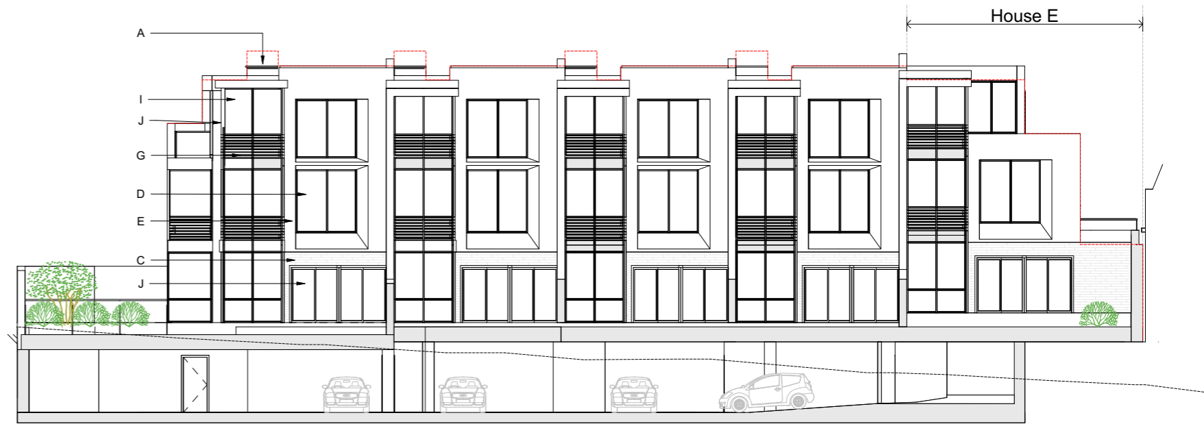
WEST ELEVATION (BACK) PRIVATE GARDENS 1 : 200

Notes: Do not Scale from this drawing Use figured dimensions only This drawing is the copyright of the architect and may not be reproduced without permission. This scheme is subject to all necessary consents. Dimensions, areas and levels where given are approximate and subject to site survey. All dimensions are to be checked on site. Any discrepancies are to be reported to the architect before the work commences. Figured dimensions only are to be taken from this drawing. This drawing is to be read in conjunction with all relevant consultants' and/or specialists drawings/documents and any discrepancies or variations are to be notified to the architect before the affected work commences.